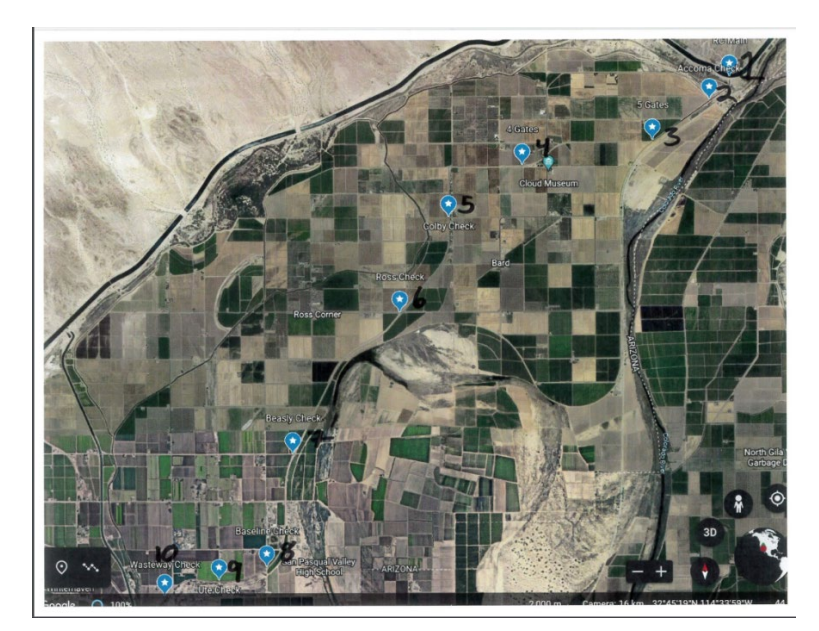
Figure 1 MAP with gate locations numbered 1-10