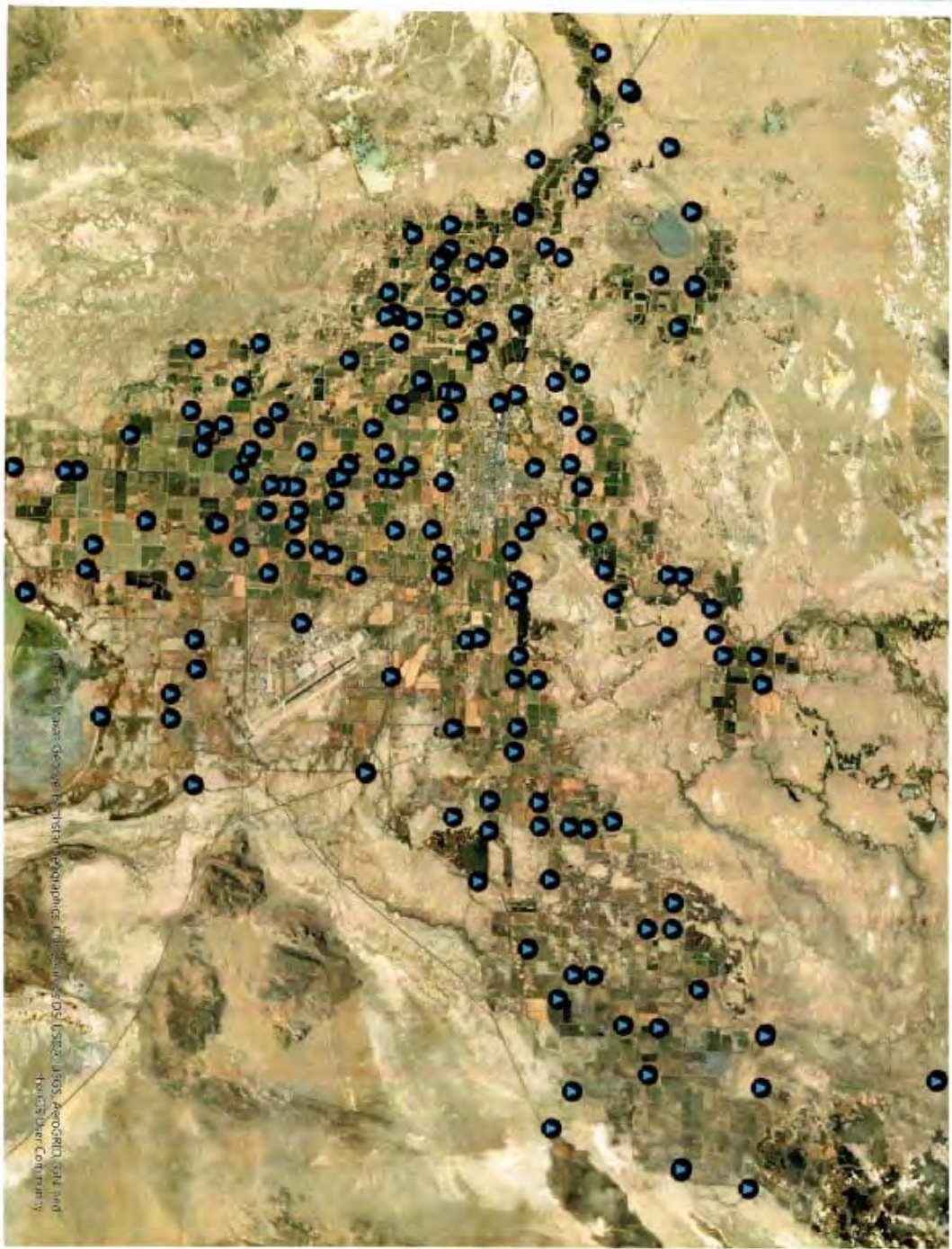
Appendix A map of the locations of the current 157 meters throughout the District