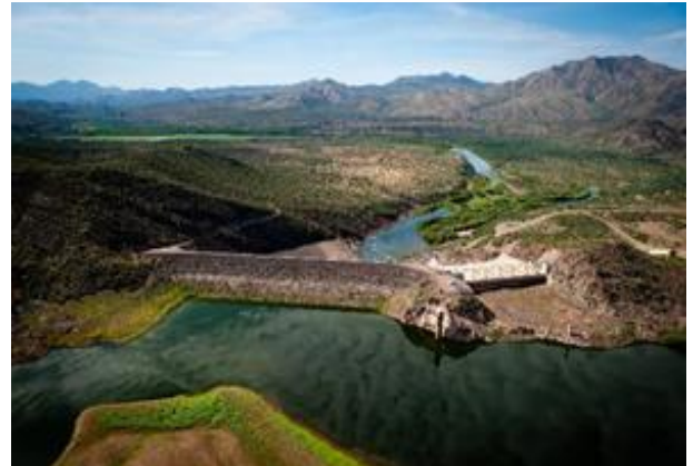
Horseshoe Dam north of Phoenix, Arizona