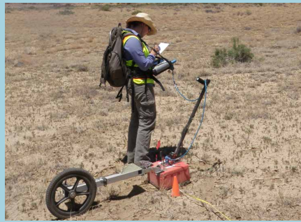
An archaeologist from the Statistical Research, Inc. conducts magnetometry and ground penetrating radar along the Navajo-Gallup Water Supply Project at Reach 10.1.

Last spring archaeologists conducted further investigations for cultural resources located in the portion of the proposed pipeline route called Reach 10.1.1 (aka the Coyote Canyon