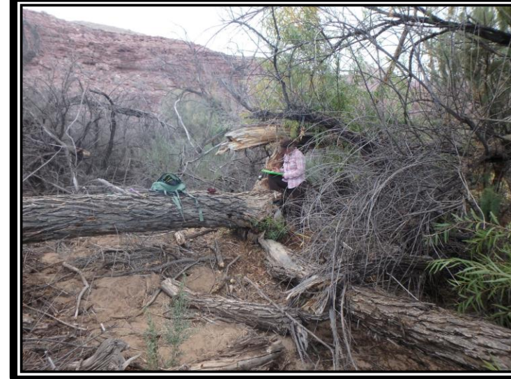
Photos: Cardenas Creek (RM 71.6L) habitat before tamarisk beetle in 2010 (upper) and after in 2017 (lower).