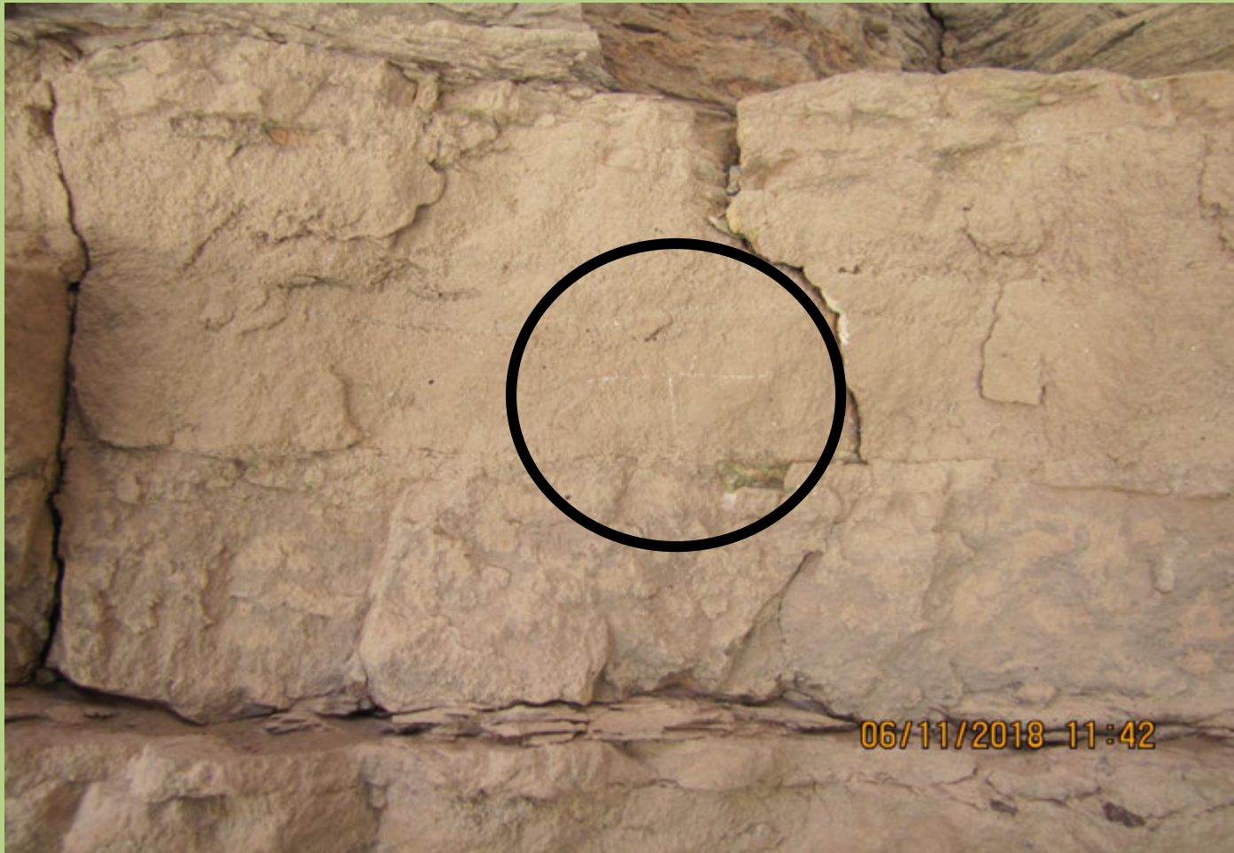
The two to three inch "T" etched into a wall in the central part of the Deer Creek Narrows.