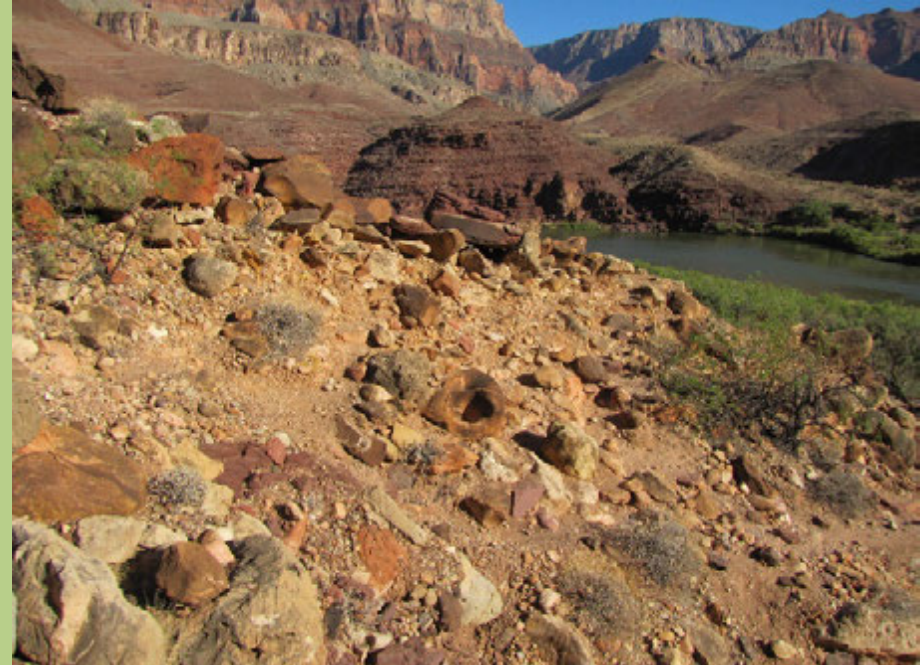
Trailing at the Tanner site. Photos from 2017 (left), and 2018 (right) illustrate ongoing and extensive trailing across the hillside.