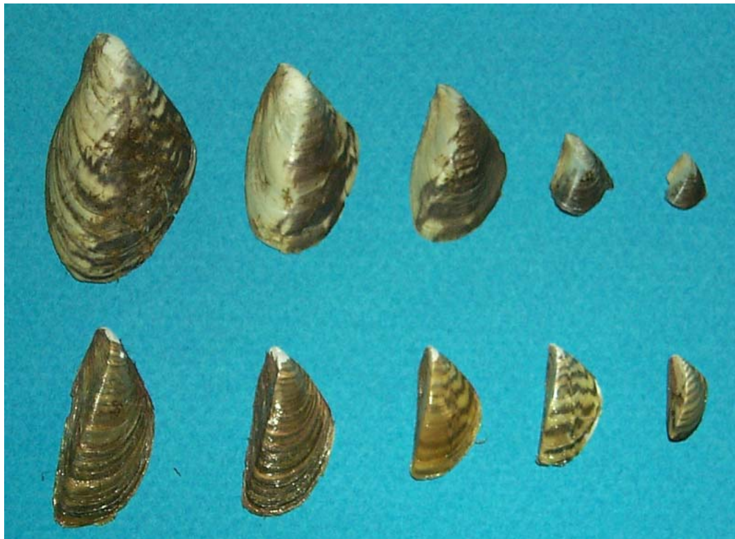
Figure 1: Quagga mussels ( Dreissena bugensis , top row) and zebra mussels ( Dreissena polymorpha , bottom row).

Nonnative zebra and quagga mussels ( Dreissena polymorpha and Dreissena bugensis , respectively; fig. 1) were accidentally introduced to the Great Lakes in the 1980s and subsequently spread to watersheds of the Eastern United States (Strayer and others, 1999). The introduction of Dreissena mussels has been economically costly and has had large and far-reaching ecological impacts on many freshwater ecosystems.