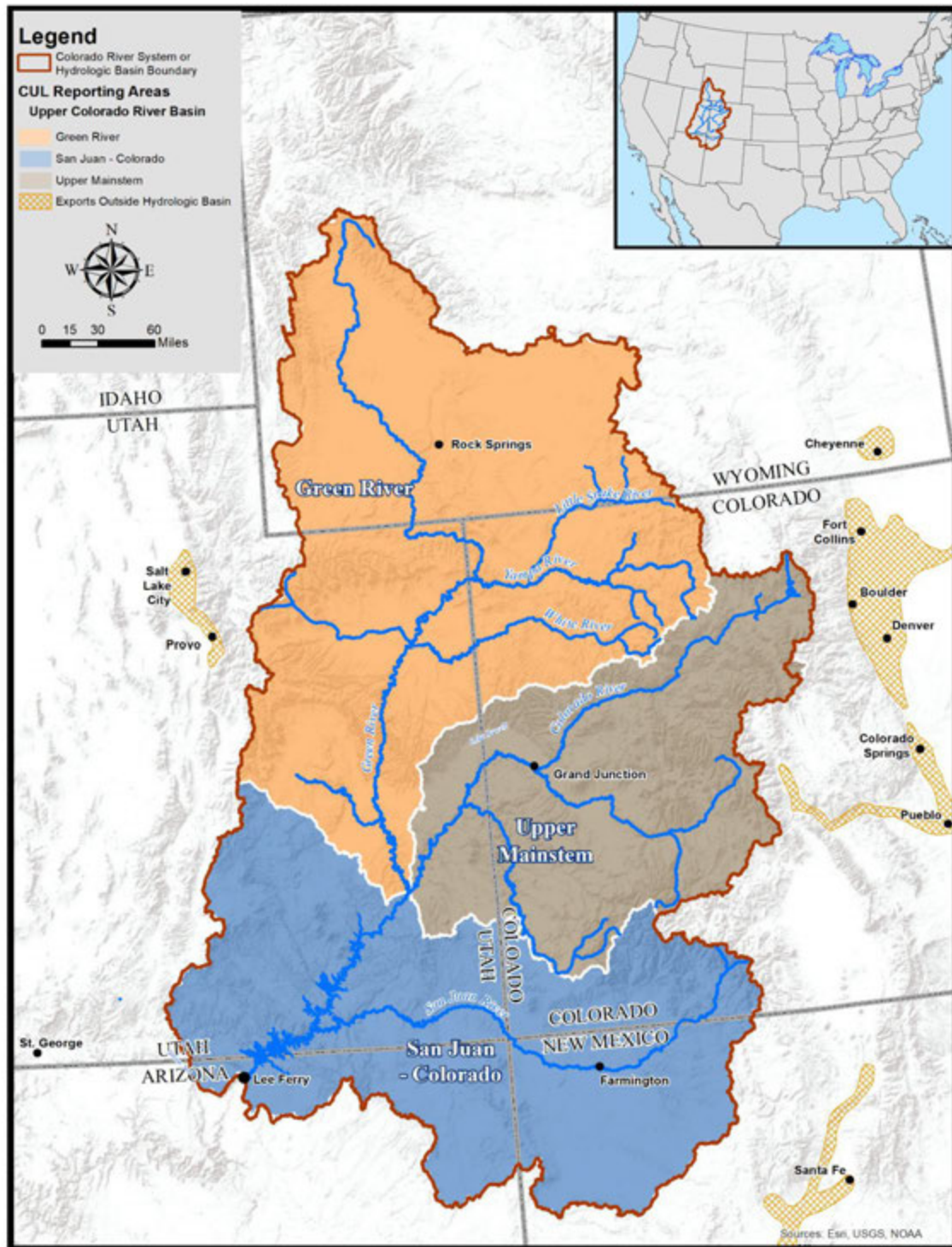
Reporting Areas for Upper Colorado River basin Consumptive Uses and Losses Report, Public Law 90-537