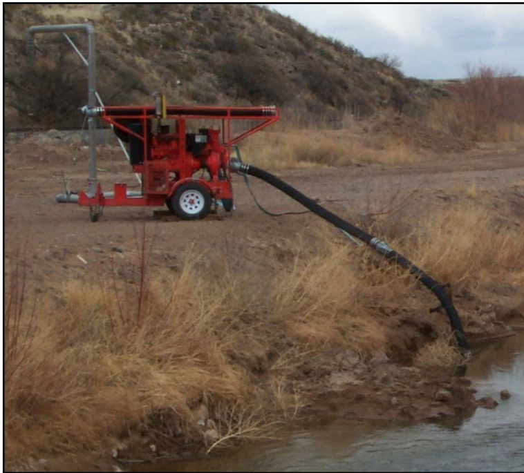
Figure III-1. Typical water pump setup for dust abatement

and in project areas during implementation when there is not sufficient moisture in the soil to inhibit the formation of dust. Dust abatement involves placing water onto an earthen surface. Water sources may include the Rio Grande, irrigation and drainage facilities, the LFCC, city water system, or wells. The Rio Grande will be used only when water is unavailable from other sources or is cost prohibitive. Water from an open water source typically is derived through using a pump setup similar to that shown in Figure III-1. Pumping from the Rio Grande for river maintenance sites will use a 0.25-inch mesh screen at the opening to the intake hose to minimize entrainment of aquatic organisms. Typically, this would be done in areas that are clear of riparian vegetation and wetlands.