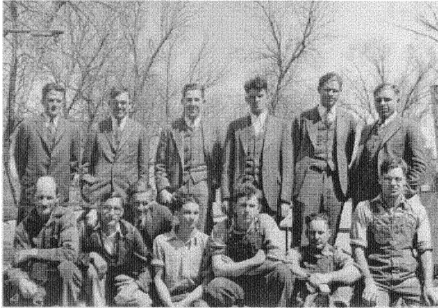
Figure 1. 1931 Photo of Reclamation Hydraulic Laboratory staff at Fort Collins

with hydraulic turbines. Eventually, hydraulic laboratories were established in government facilities such as the Miami Conservancy District in Ohio, the U.S. Bureau of Standards, U.S. Army Corps of Engineers, Soil Conservation Service, and the U.S. Bureau of Reclamation.