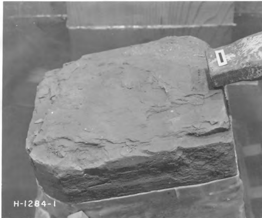
Sample at start of test