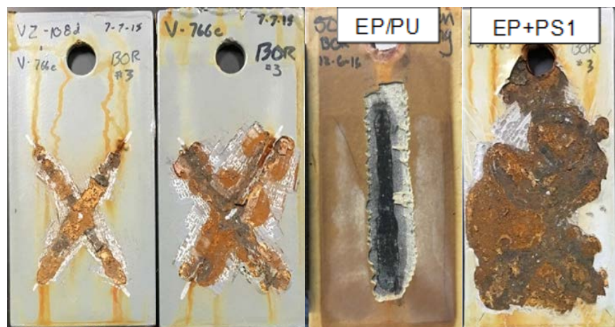
Cyclic test panels shown post-test after coating removal. Rust creep measured following 5040 hrs of cyclic exposure testing. The best (epoxy/polyurethane hybrid) and worst (epoxy primer & polysiloxane topcoat) performing materials and compared with vinyl resins V-766e and VZ-108d+V-766e.

Vinyl resins including their history, use, and formulation. An initial long term evaluation consisting of immersion testing was undertaken. This was followed up by a benchmark study which included an array of laboratory tests. The goal of these initial studies gain an understanding of vinyl's strengths in the field and in laboratory testing. The final phase of the testing was a comprehensive laboratory evaluation program which included a variety of product chemistries.