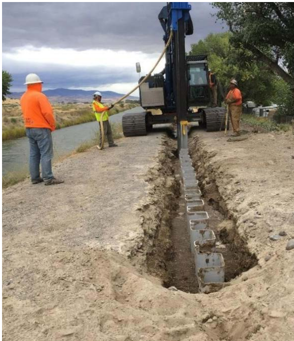
Installed synthetic sheet pile cutoff wall.

Findings from this study can be used by Reclamation’s designers, as well as in local water districts, and can provide a cost-effective alternative to improve canal safety. The TSC looks forward to supporting the regional and area offices in implementing the findings from this study.