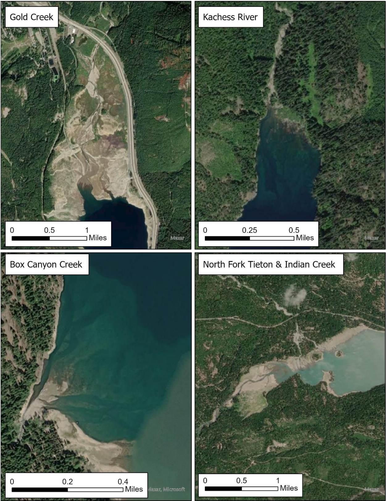
Figure 2. Examples of four reservoir deltas in the Yakima River Basin. Gold Creek enters Keechelus Reservoir, the Kachess River and Box Canyon Creek enter Kachess Lake, and the North Fork Tieton and Indian Creek enter Rimrock Reservoir.