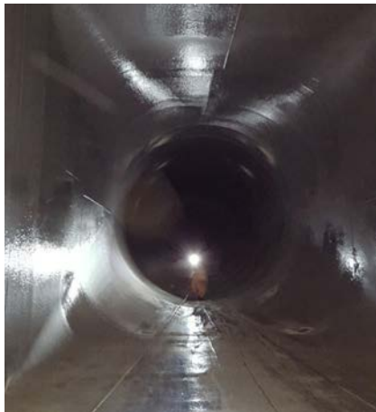
Final coating inspection with defect-free, high quality lining.