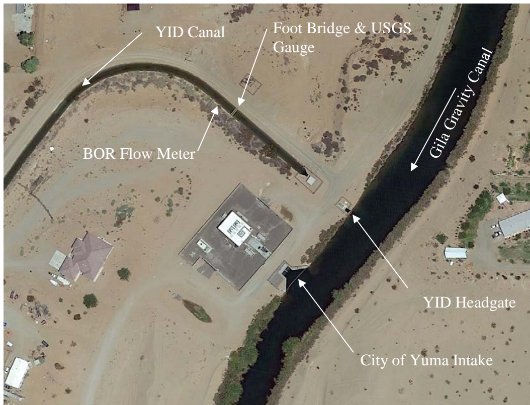
Figure 2 - Overview of the YID headgate with annotations of relevant features.

Gravity Canal and water is withdrawn into the YID canal through a single vertical slide gate style headgate. Several years ago the City of Yuma build a large headworks structure that withdraws water from the Gila Gravity Canal 170 feet downstream of the YID headgate. Since the construction of the City of Yuma Headgate, YID has been subject to fluctuating water surface elevations in the Gila Gravity Canal each time the City of Yuma operates their headgates (opens or closes). These fluctuations make it difficult for YID to maintain a constant flow down their canal, without making adjustments to their headgate setting.