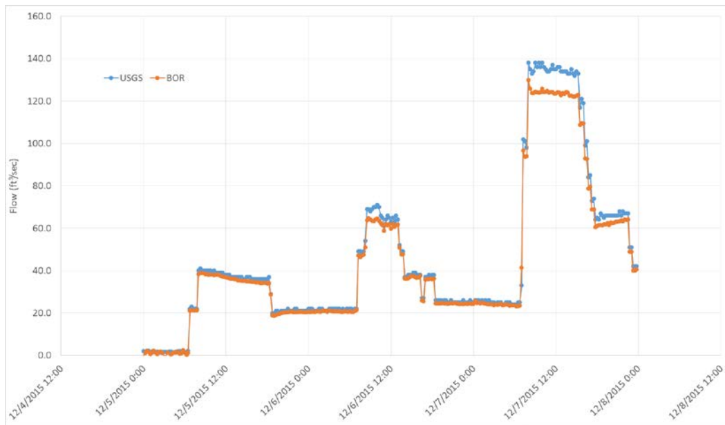
Figure 3 - Flow rate comparison between BOR and USGS meters.

the output of their gauge site to align with flow measurements obtained with Acoustic Doppler Current Profilers (ADCP). BOR implemented a velocity index parameter in the IQ to improve the measurement agreement with the USGS measurements. As seen in Figure 3 both the USGS and BOR meters compare very well up to about 80 ft 3 /sec in the canal, when the USGS meter starts to read higher than the BOR meter. This differential appears to be due to USGS modifying the inputs to their meter to more closely align with their ADCP measurements. Conversations with the USGS office indicate that they only use outputs of velocity from the sensor they have installed and all flow calculations are performed in the USGS NWIS system using a specified index-velocity method.