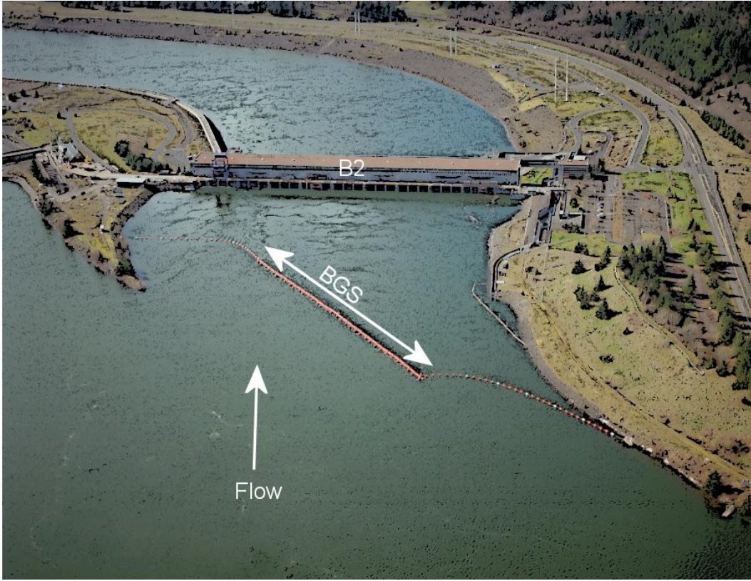
Figure 2. The Behavioral Guidance Structure (BGS) with One Section Shown out of the Water (above); and Shown Deployed in the Forebay of the Bonneville Dam Second Powerhouse (B2; below).

Wiskeytown Reservoir uses two underwater curtains that were installed in 1993 to pass cold water through the reservoir. The oak bottom curtain near the head of the reservoir causes inflowing cold water to sink to the bottom of the reservoir. The Spring Creek curtain located near the dam helps the intake withdraw colder water from deep within the reservoir. These temperature curtains successfully route cold water through the reservoir.