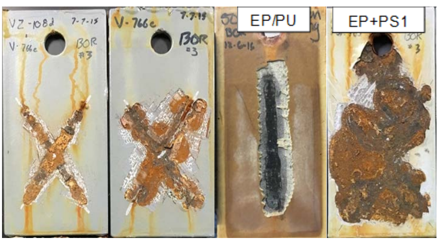
Cyclic test panels shown post-test after coating removal. Rust creep measured following 5040 hrs of cyclic exposure testing. The best (epoxy/polyurethane hybrid) and worst (epoxy primer & polysiloxane topcoat) performing materials and compared with vinyl resins V-766e and VZ-108d+V-766e.

Vinyl resins including their history, use, and formulation. An initial long term evaluation consisting of immersion testing was undertaken. This was followed up by a benchmark study which included an array of laboratory tests. The goal of these initial studies gain an understanding of vinyl's strengths in the field and in laboratory testing. The final phase of the testing was a comprehensive laboratory evaluation program which included a variety of product chemistries.