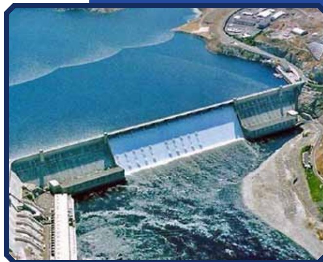
Grand Coulee Dam, Washington— a more challenging project.