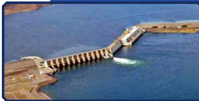
Rock Island Dam, Washington —a simpler project model.

www.usbr.gov/research/projects/detail.cfm?id=9650