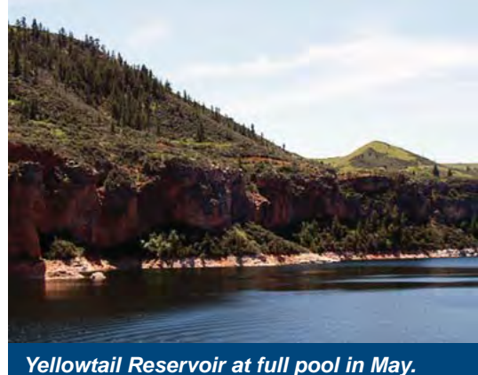
Yellowtail Reservoir at full pool in May

The contents of this document are for informational purposes only and do not necessarily represent the views or policies of Reclamation, its partners, or the U.S. Government. Any mention of trade names or commercial products does not constitute an endorsement.