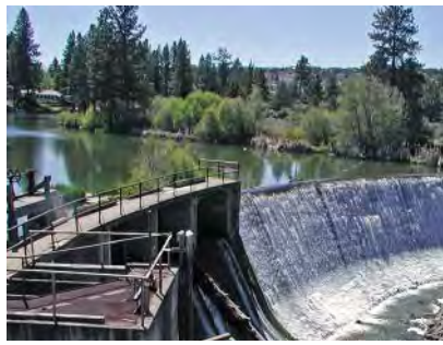
Bend Diversion Dam on the Deschutes River. It diverts water for the North Unit and Pilot Butte Canals.

The response of aquifer systems to climate-driven changes in the seasonality of recharge will vary with spatial scale. Simulation results show that short flow path ground water systems, such as those providing baseflow to many headwater streams, will likely have substantial changes in the timing of discharge in response changes in seasonality of recharge. Regional-scale aquifer systems with long flow paths, in contrast, are much less affected by changes in seasonality of recharge. Flow systems at all spatial scales, however, are likely to reflect interannual changes in total recharge.