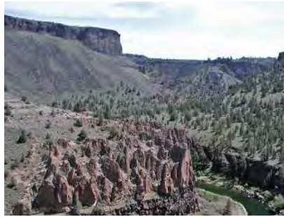
Crooked River (tributary of the Deschutes River) near Crooked River Ranch several miles above Lake Billy Chinook.