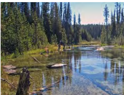
Quinn Creek is a spring-fed stream in the Upper Deschutes Basin that flows into Hosmer Lake.

“More accurate predictions of hydrologic changes will help water managers more effectively plan water operations over the next century. Insights from the Upper Deschutes Basin have general applicability to other regional ground water systems with mountainous recharge areas.”