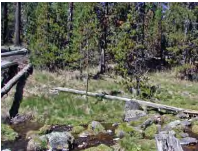
Fall River Headwater Spring is a spring-fed tributary of the Deschutes River with a mean annual flow of about 150 cubic feet per second.