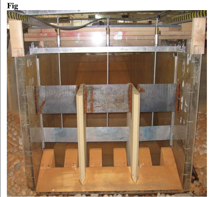
Figure 2. Looking upstream at the Fontenelle model stilling basin with staggered upper and lower 3-panel flow deflectors.