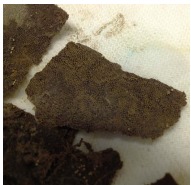
Figure 2. Sponge gemmules collected from settlement plates at Imperial Dam, CA in February 2015