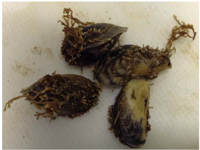
Figure 1. Adult quagga mussels collected at Imperial Dam, CA with sponge overgrowth.

growth started at about 3 meters. Plates closer to the trash rack had fewer sponges, possibly because of high flow and more sediment on the plates. Sponges were found growing on top of some adult mussels (Figure 1). In February 2015, a significant amount of sponge gemmules (Figure 2) were found on the plates and wire stringers deployed at Imperial Dam, indicating there was a large sponge population that year. Gemmules are internal buds involved in asexual reproduction, that are resistant to harsh environmental conditions and can lay dormant until less hostile conditions appear.