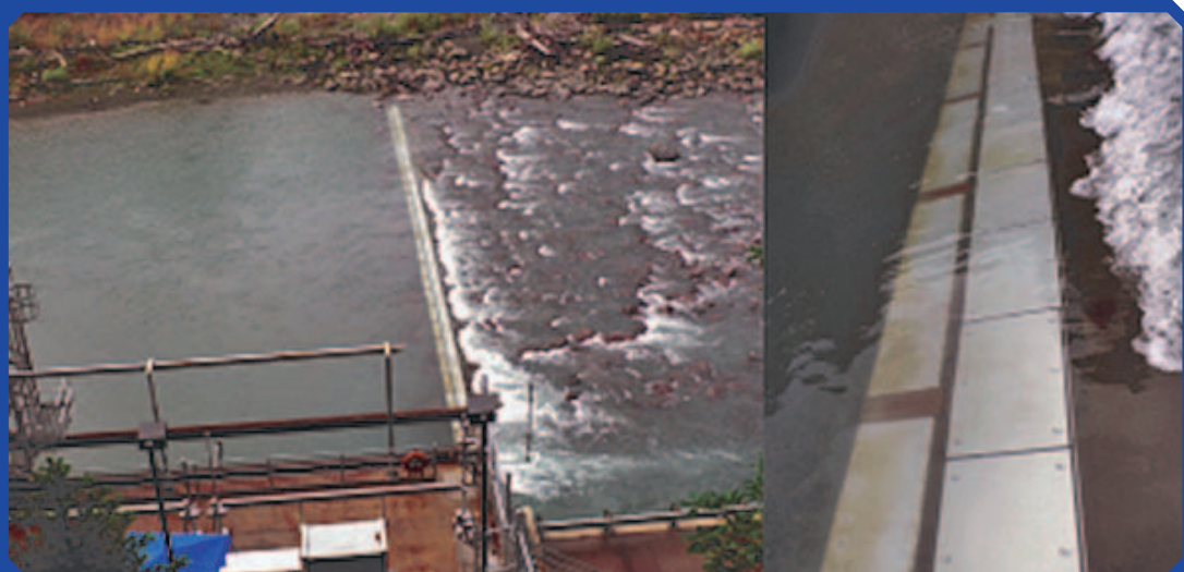
Photograph looking down on the Elwha River impact plate system and surface water diversion structure (left). Closeup photograph of the impact plates mounted on the downstream side of a concrete weir (right). In both images the flow of water is from left to right.

While these plates can measure the signals generated as bed load moves across them, the signals need to be interpreted. Characterizing bed load based on these signals requires understanding these signals—which signals indicate what amount and type of sediment movement?