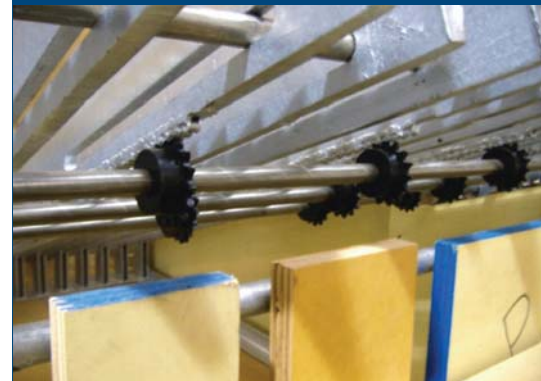
Photograph 2.—Shaft/sprocket drive system.