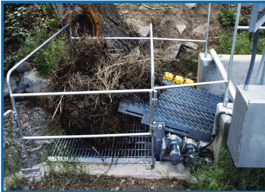
Photograph 3.—Prototype trashrack installation and operation at the Tetsel Ditch site in northeastern Colorado.

The Reclamation research project team are in discussions with the Angostura Irrigation District (Angostura) in southwestern South Dakota, along with the Dakota Area Office Water Conservation Field Services Program, to explore the possibility of installing a similar unit at Angostura's Cheyenne River inverted siphon entrance. Historical debris accumulation problems at this site are a key issue that led to development of the self-cleaning trashrack concept. With the solar-charged power configuration, this system can be suitable for sites where debris accumulation is a problem at almost any open channel location. The team estimates that total costs (including concrete placement) for a structure similar to the prototype unit (~3-foot-wide channel) will range from $20,000 to $30,000.