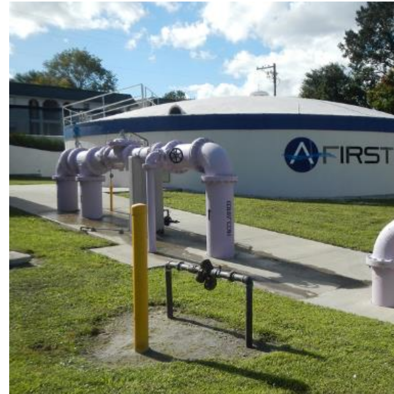
A storage facility with purple pipe distribution in Altamonte Springs, Florida.