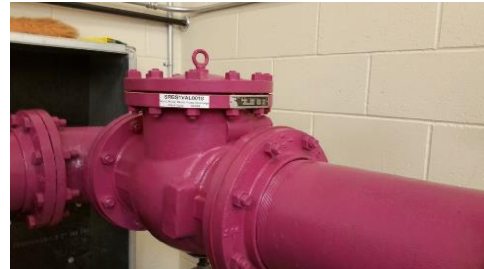
Purple pipes in the City of Meridian, Idaho, which has begun installing water reuse infrastructure with a goal to "recycle and/or reuse 80 percent of the waste stream" by 2030.