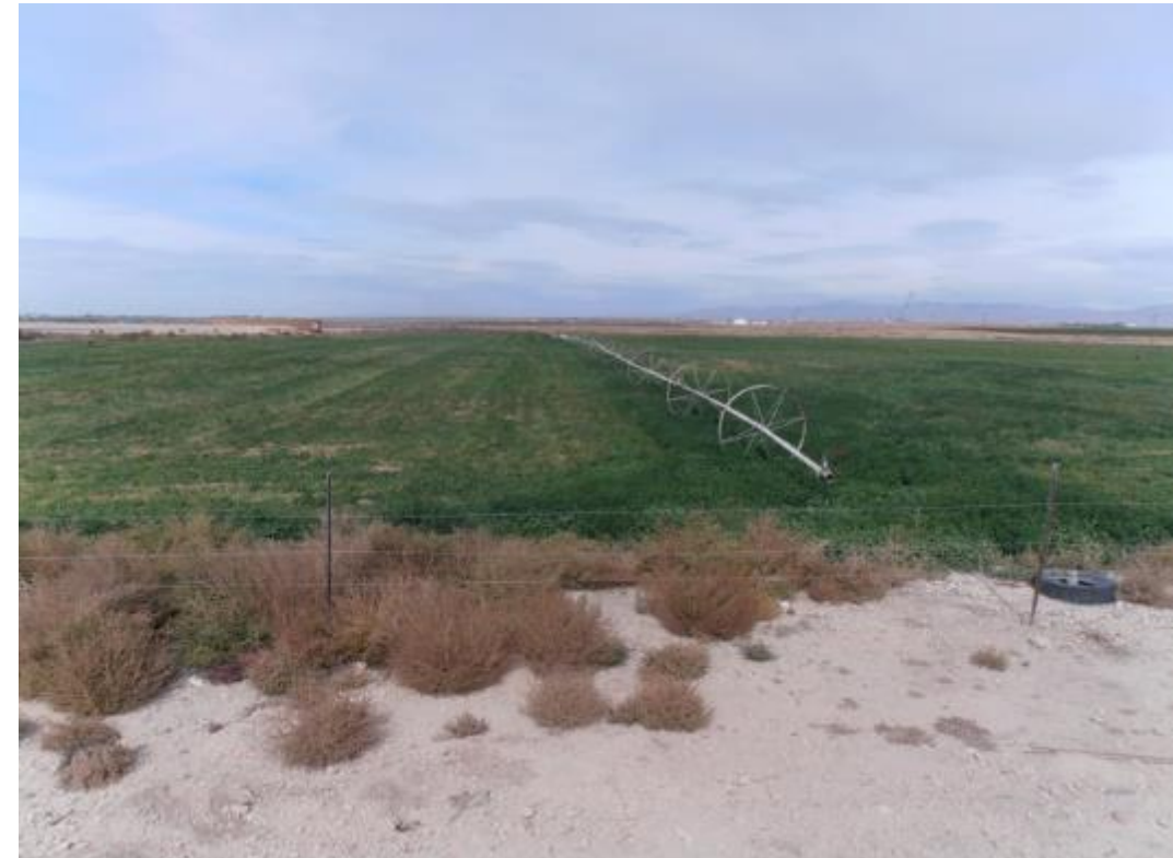
A large wheel line sprinkler system in Idaho.