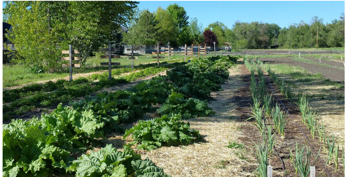
The private Hidden Springs sewage treatment facility provides treated wastewater to be reused for irrigation on public and small-scale crops.