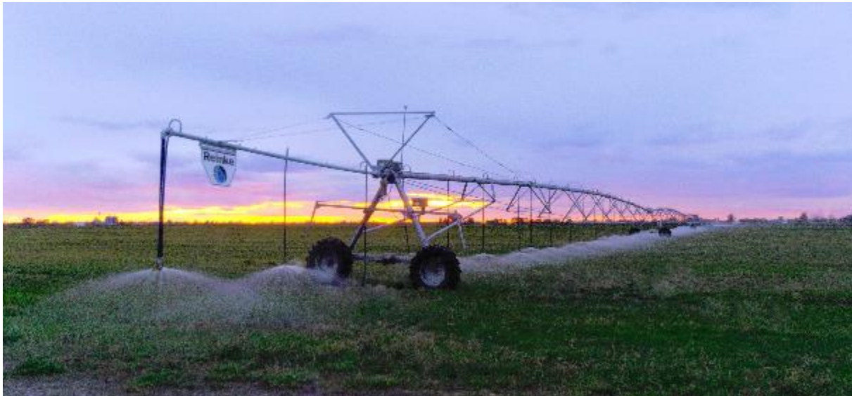
A farm in Idaho applies treated, reclaimed wastewater to a potato field.

“Going forward, perhaps the most important action EPA can undertake is to maintain its stature as an honest broker for water reuse policy. As our nation’s lead regulator for water policy, the Agency is in a unique position, one that allows the Agency to backstop sound local and state decision making.”