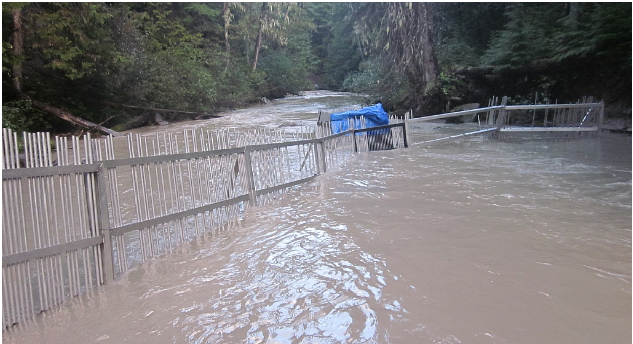
Figure 9. North Fork Tieton River fish trap after the high flow event on September 22, 2013 had partially collapsed the two weir panels on the right bank and weir pickets had been pulled to relieve pressure on the panels. The photo was taken the next day after the river had receded.

The second high flow event began the afternoon of September 27 with a steadily rising river that seemed to level off by late night. However, heavy rains occurred the next day and by very early in the morning of September 29 the river was rising rapidly. Efforts to save the trap in the pre-dawn hours were halted because of dangerous conditions. A few hours later the trap began to disintegrate and washed downriver (Figure 10). Our trapping operation had come to a quick and decisive end. (Note: all of the weir and trap box components were recovered a few days later when the river had receded. Some had washed as much as 200 meters downstream).