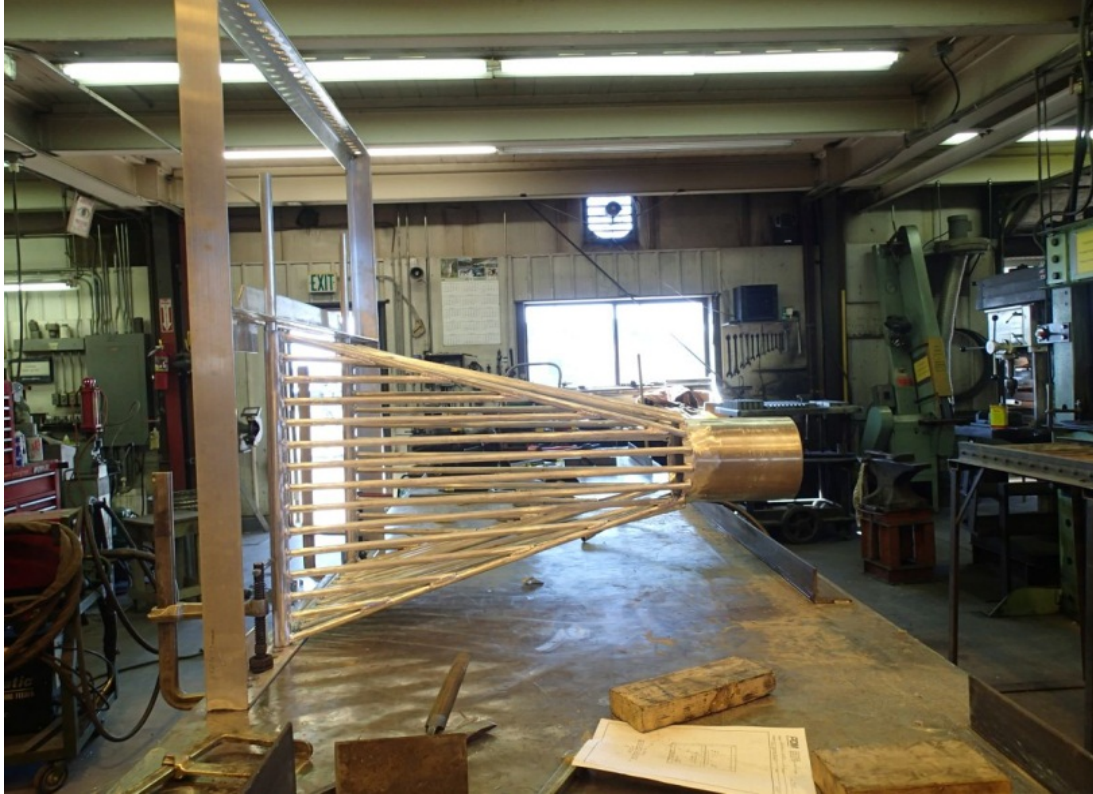
Figure 7. Modification to the entrance of the 2013 trap in WDFW's screen shop