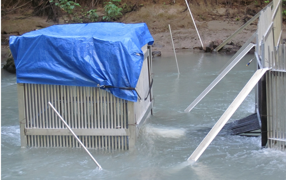
Figure 8. The modified configuration of the trap used in 2013. Note the modified entrance leading to the PVC pipe extending into the trap. The trap itself sits about five feet from the entrance.

fourth data logger was deployed on August 6 in the outlet channel of Clear Creek Dam. The data loggers used were Onset Hobo® Water Temp Pro v2 (#U22-001).