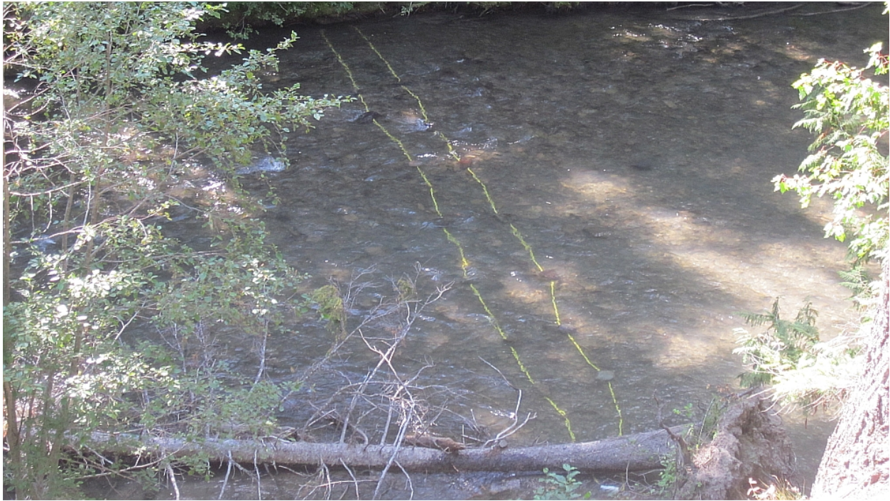
Figure 3. Antenna installed in the North Fork Tieton River on August 1, 2013