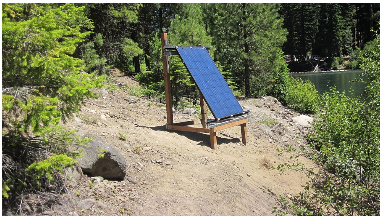
Figure 5. Solar panels installed to power the lower spillway antenna