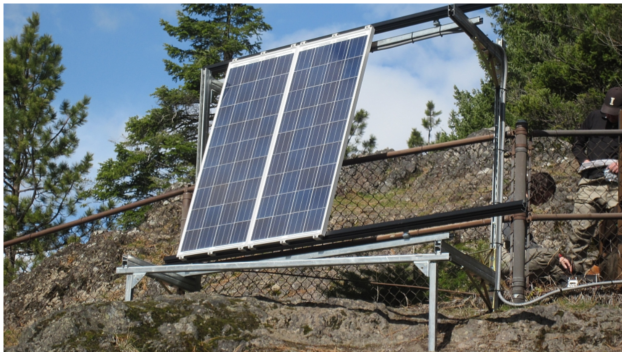
Figure 1. Solar panels installed to power the upper spillway and ladder antennae

insight into our trapping efficiency upstream, and provide essential data to assist in the development of a mark-recapture population estimation.