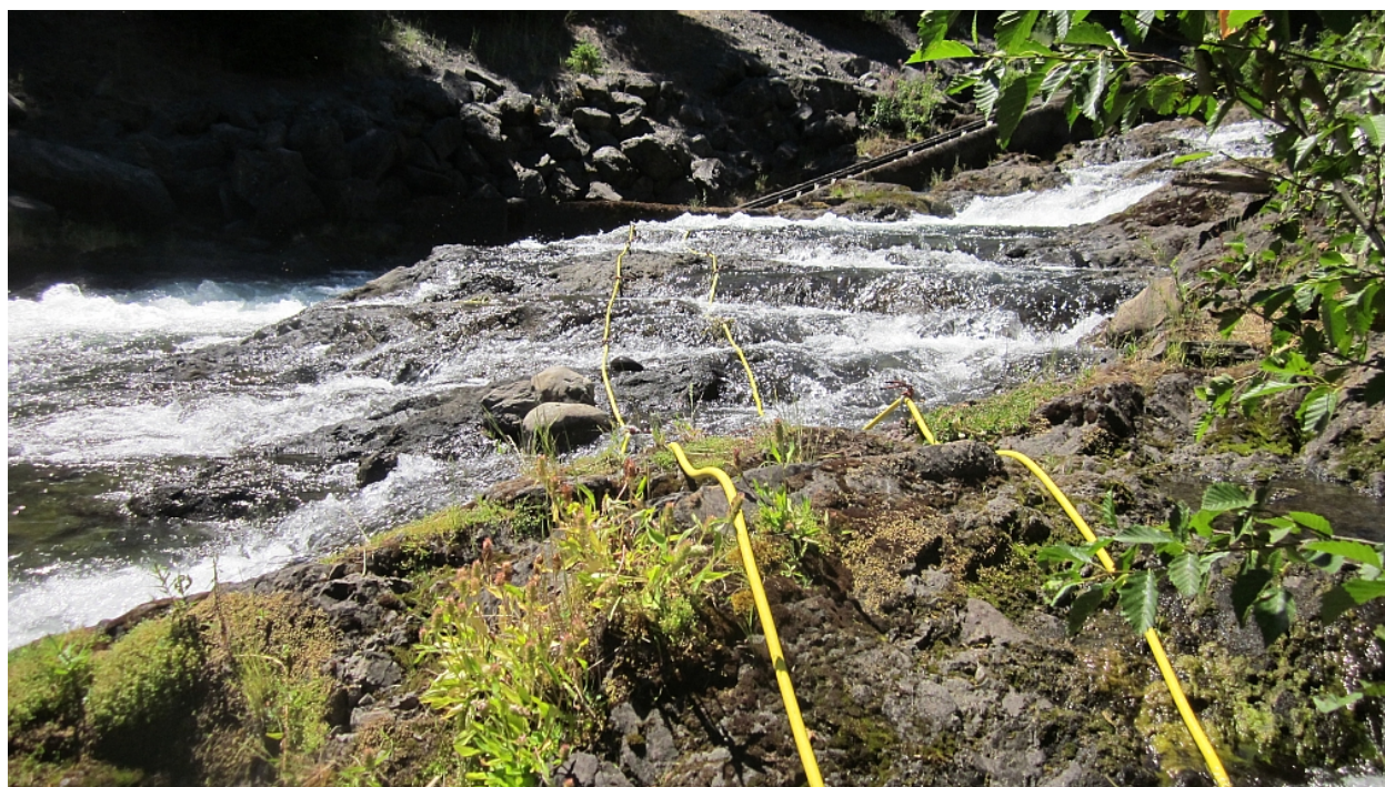
Figure 2. Antenna installed at the lower terminus of the spillway channel on July 9, 2013