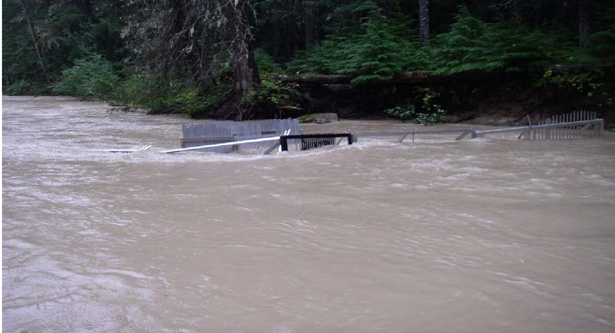
Figure 10. North Fork Tieton River fish trap during the high flow event which occurred at the end of September, 2013. This photo was taken the morning of September 29 th . The left weir panels have already washed downstream. The remaining panels and the box were gone soon after. The river continued to rise.