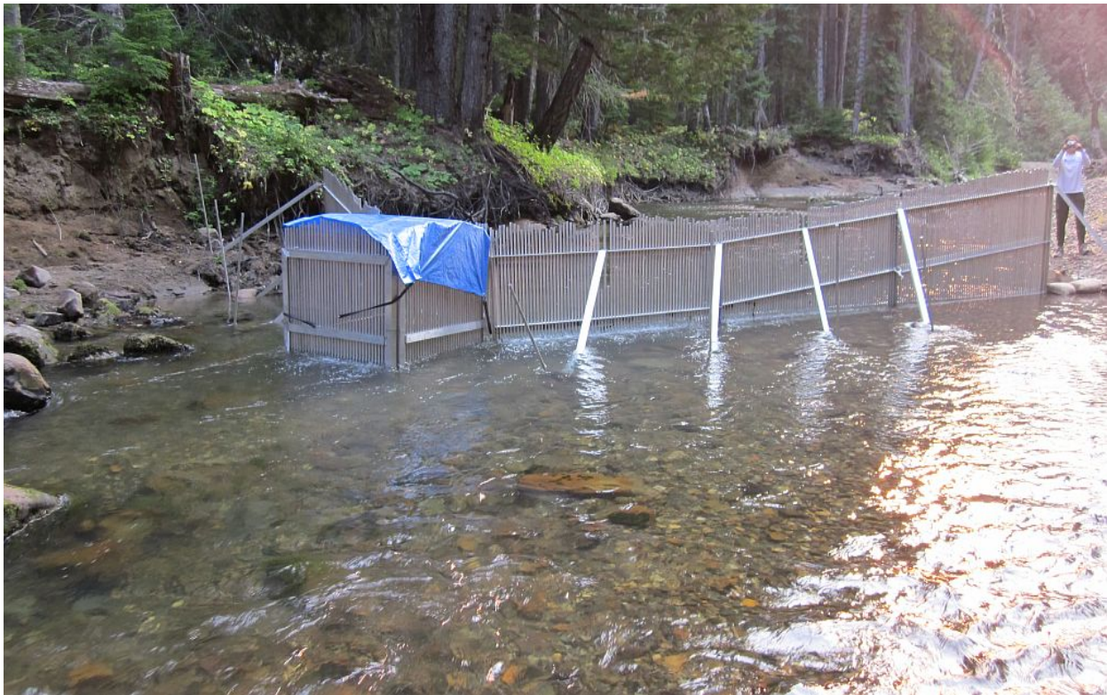
Figure 6. The picket-weir box trap use in 2012 on the North Fork Tieton River

The same picket-weir box trap that was used in 2012 was again utilized in 2013 but with some significant modifications. Having noted the escape of two bull trout from the capture box in 2012 and avoidance behavior (trap shyness) displayed by a few bull trout approaching the trap entrance, these modifications were deemed necessary. Figure 6 shows the trap configuration used in 2012. The trap box was directly connected to adjacent weir panels. The entrance to the trap (not pictured) was flat and perpendicular to the current with two wings extending into the trap where fish would pass through a vertical opening 4-5 inches wide. It was thought that trapped fish would be disinclined to go back through this opening but that turned out not to be the case on at least a couple of occasions. The entrance was modified so that a caged cone extended about three feet back from the entrance (Figure 7). This cone led to a 10-inch diameter opening to which a four-foot section of PVC pipe was attached. This pipe extended about two feet into the trap and was approximately six inches above the stream bed inside it. A burlap sleeve was then affixed to the end of the pipe to further dissuade captured fish from finding the opening. Finally, the entrance to the trap was painted flat black to minimize avoidance behavior. Figure 8 shows the trap entrance and the position of the trap relative to it. All modifications were done WDFW's Region 3 screen shop.