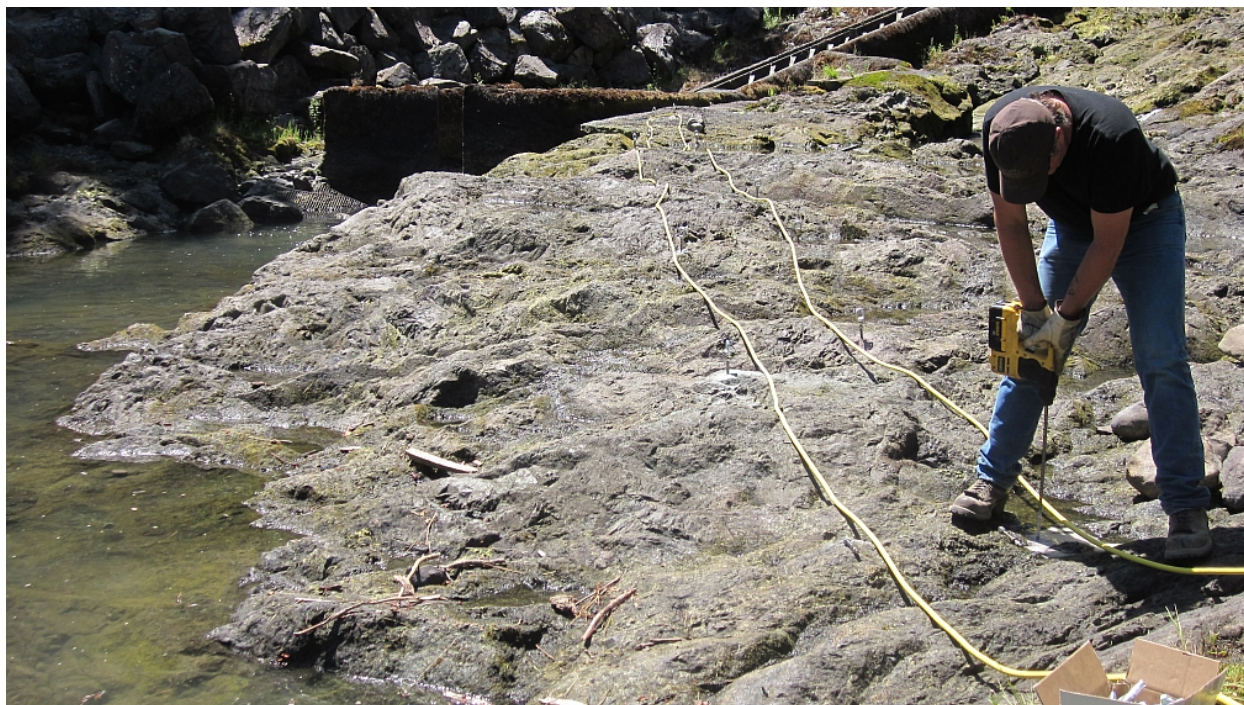
Figure 4. Installation of the lower spillway antenna on July 9, 2013