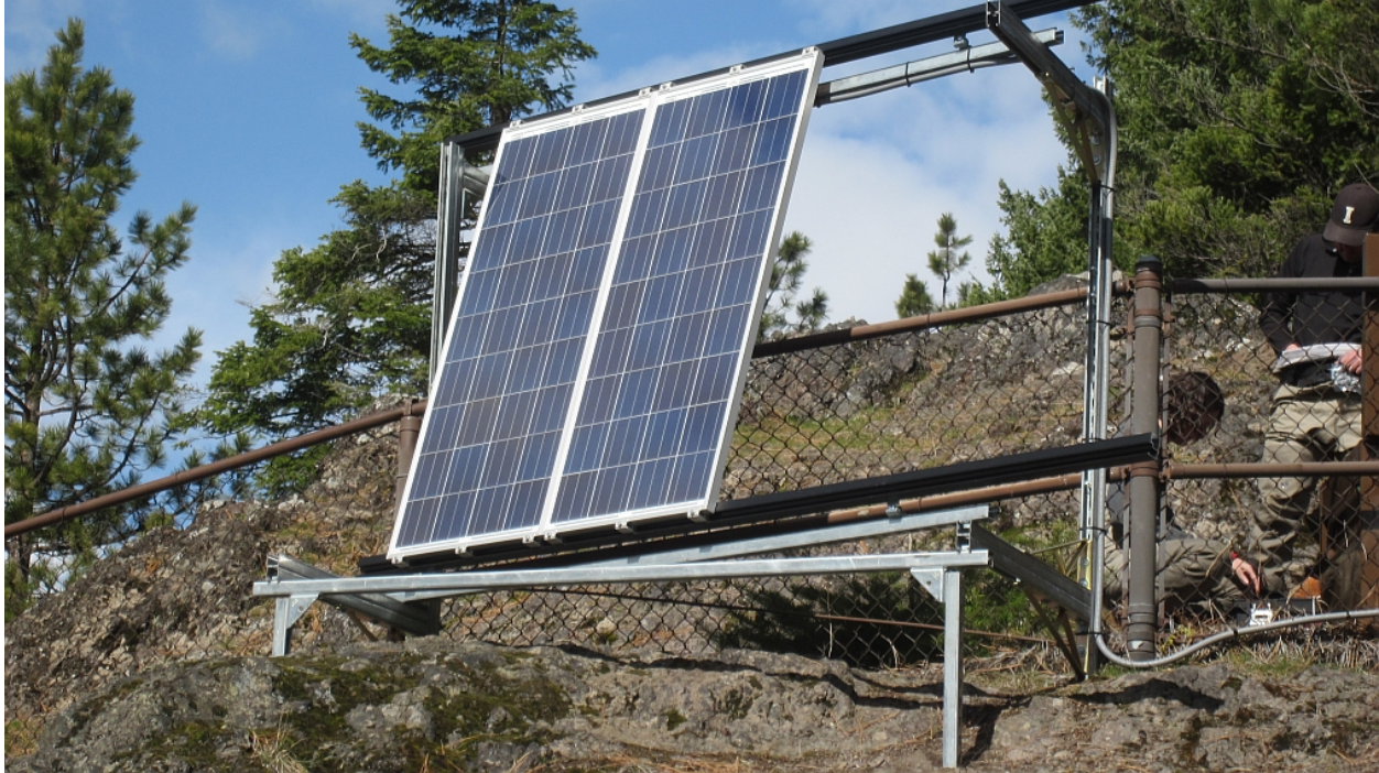
Figure 1. Solar panels installed to power the upper spillway and ladder antennae

insight into our trapping efficiency upstream, and provide essential data to assist in the development of a mark-recapture population estimation.