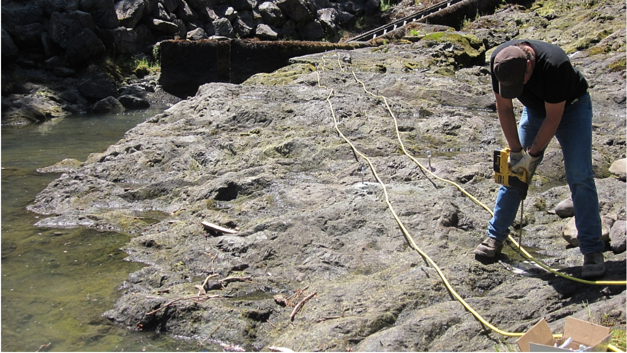
Figure 4. Installation of the lower spillway antenna on July 9, 2013