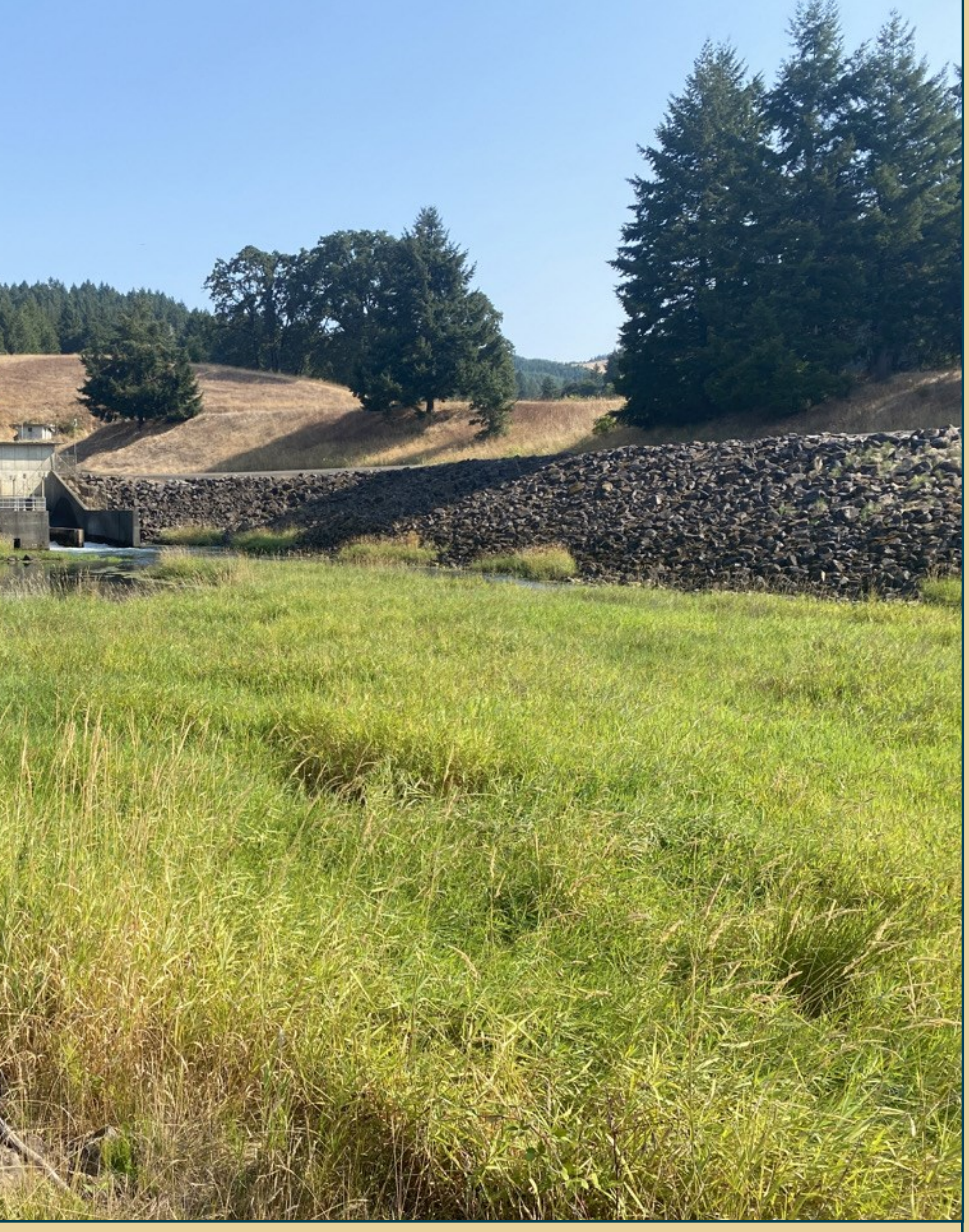
Image of Scoggins Dam spillway and outlet works.