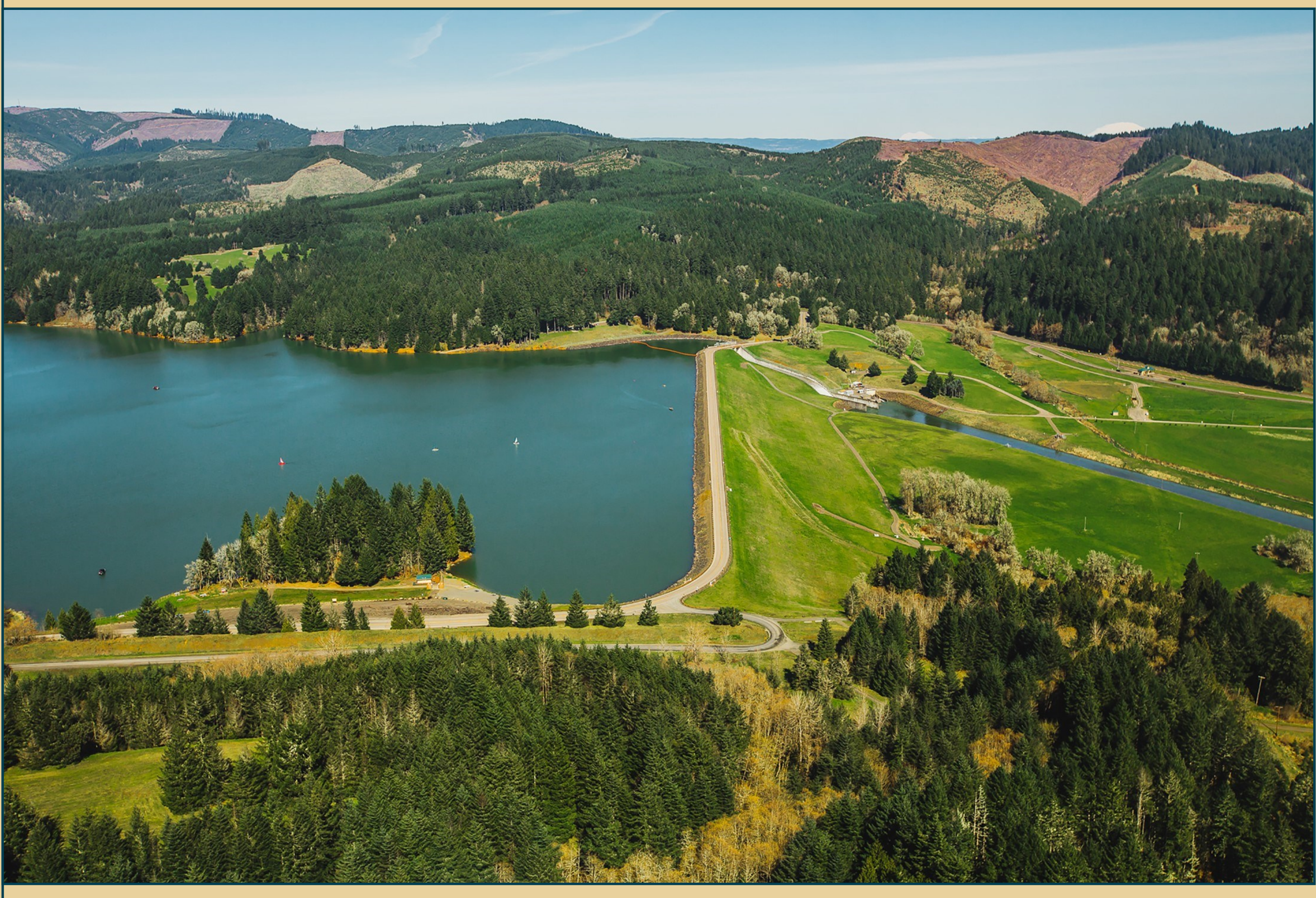
Aerial image of Scoggins Dam and Henry Hagg Lake.