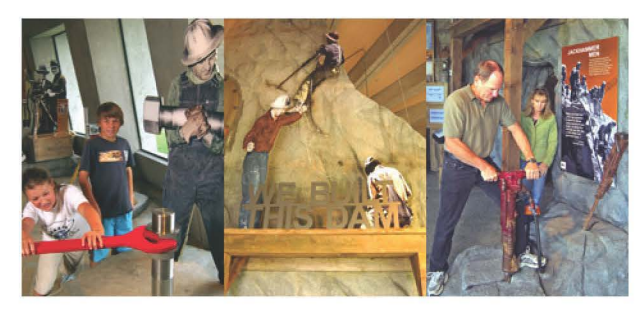
The new exhibits were designed, manufactured, and installed by Formations, Inc., of Portland, Oregon.

The Visitor Center was built in the late 1970s as part of the dam's Third Powerplant expansion. It was designed by renowned architect Marcel Breuer to resemble a generator rotor. The Visitor Center was retrofitted in 2004 to meet seismic, life-safety, and accessibility standards.