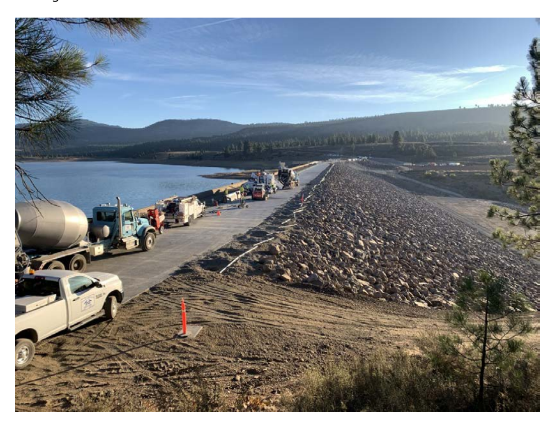
Construction of concrete barrier in progress