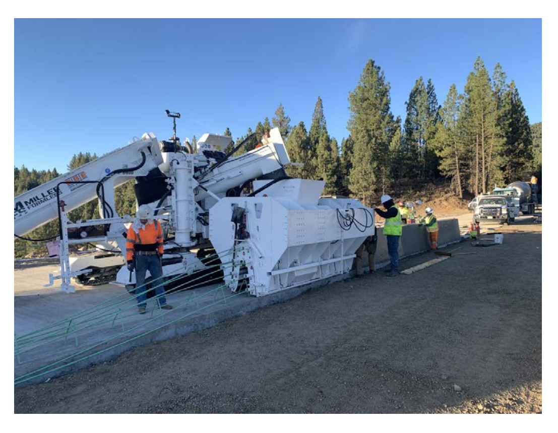
Concrete barrier placement using slip form method; this method places concrete into a continuously moving form.