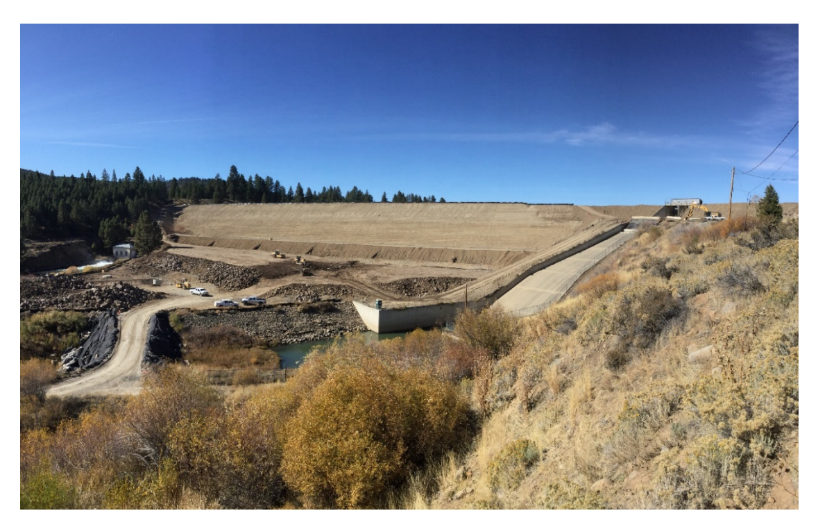
Construction of stability berm in progress