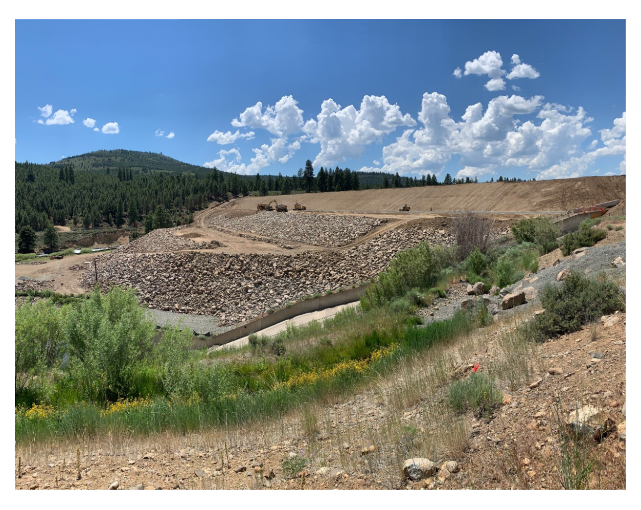
Construction of dam embankment and filter zones in progress (remove period after progress).