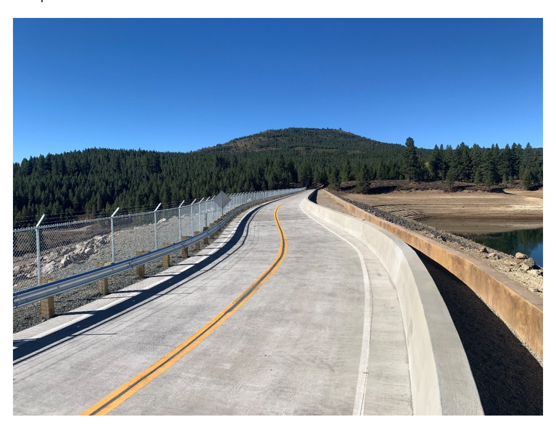
Completed Boca Dam Reservoir Road, photo 2