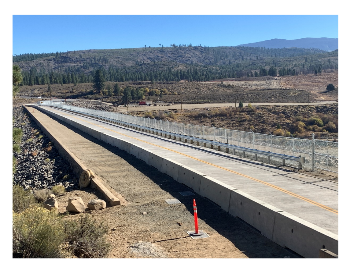
Completed Boca Dam Reservoir Road