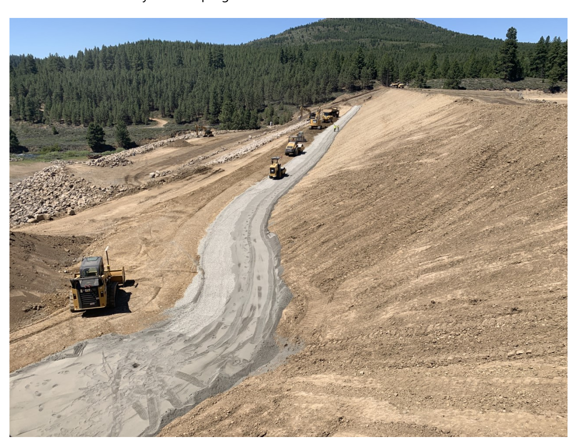
Construction of filter zones at Boca Dam; filter zones layer filter sand against existing embankment, followed by drain rock. The filter zone is then encapsulated with in-reservoir-borrow material.