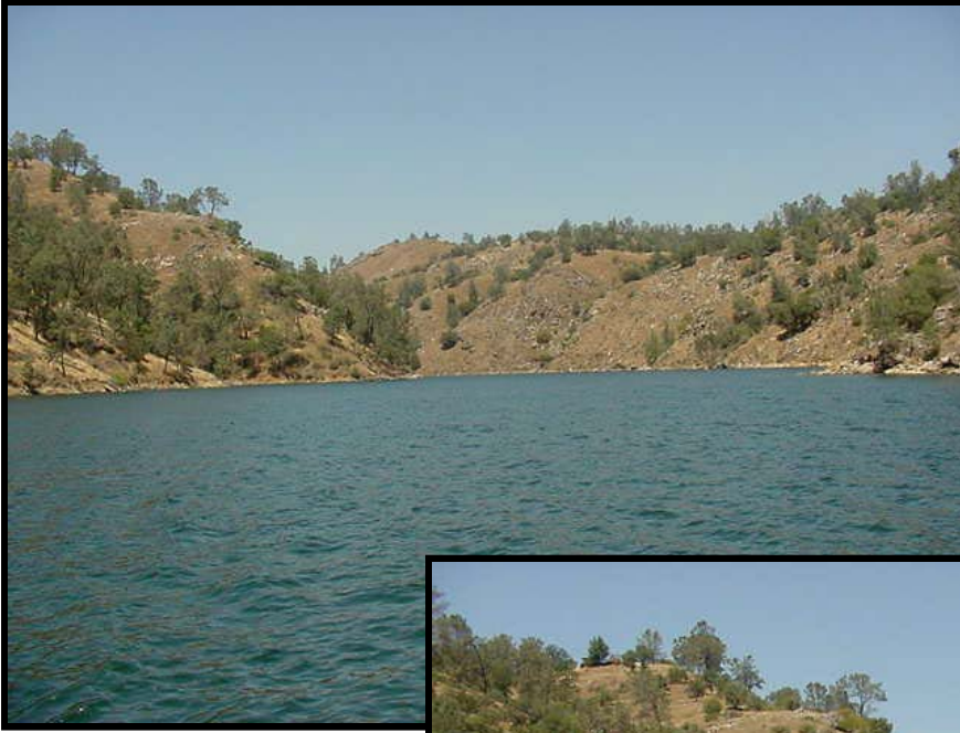
Fine Gold - Upstream view of Fine Gold Creek.