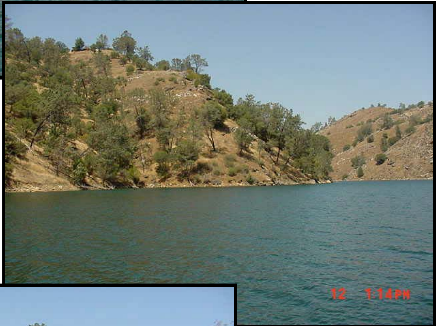
Upstream view of proposed right dam