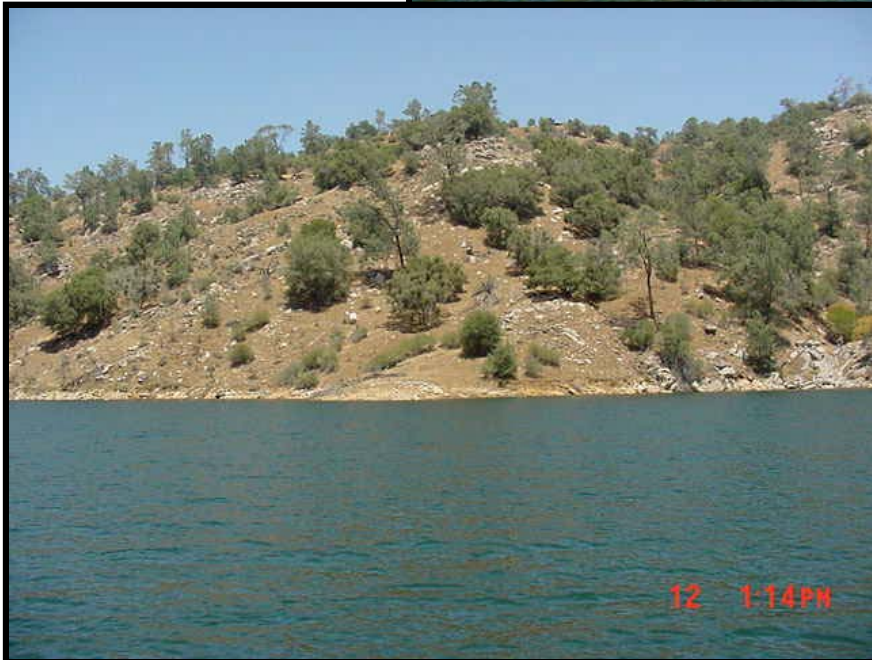
Cross stream view of proposed left abutment.