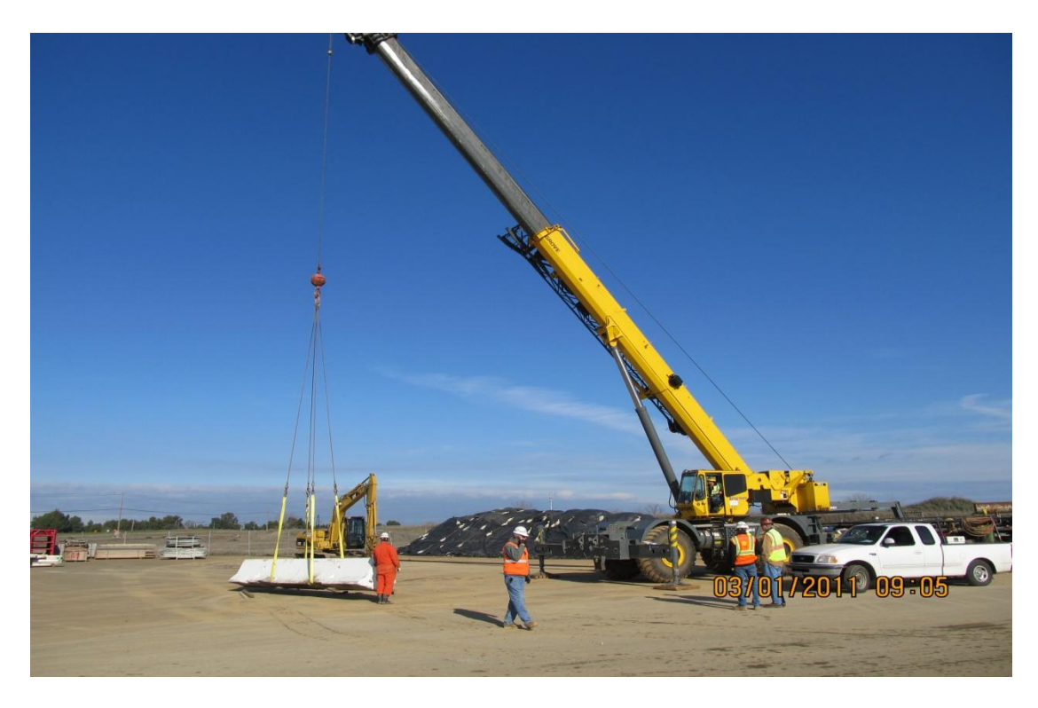
Balfour Beatty performs a load test on a hydraulic crane.