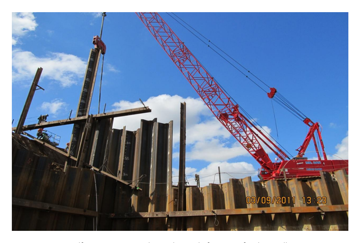
Balfour Beatty crane drives sheet pile for upper forebay wall.