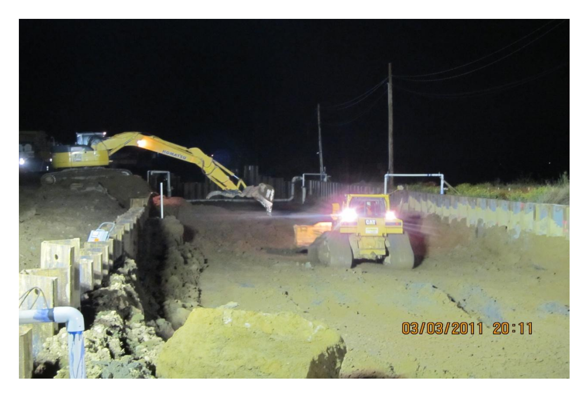
West Bay Builders subcontractor Meyers begins the Phase 2 Siphon excavation during the swing shift.