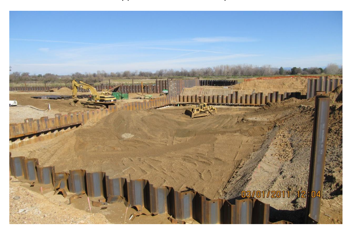
Balfour Beatty's subcontractor Meyers excavates in the pumping plant.