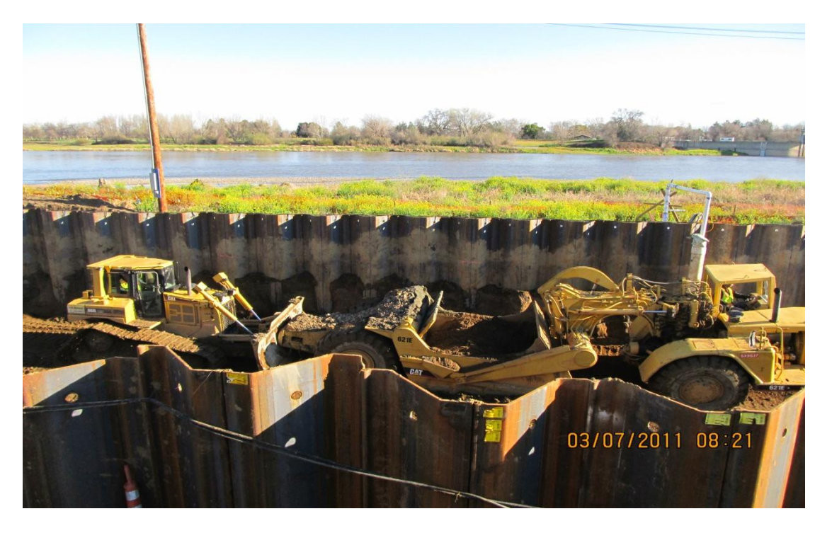
West Bay subcontractor Meyers excavating the first lift of Phase 2 Siphon.