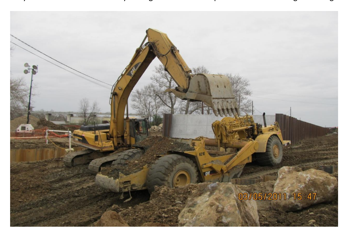
West Bay Builders subcontractor Meyers continues to remove material from the Phase 2 Siphon.