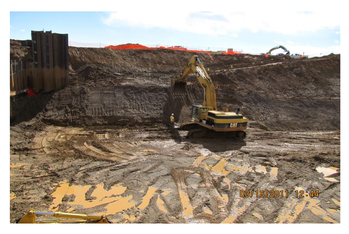
Balfour Beatty grade-checker setting grade along the slope in the pumping plant.