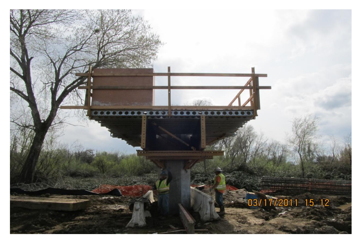
West Bay Builders installs the EFCO forms for Column #5.