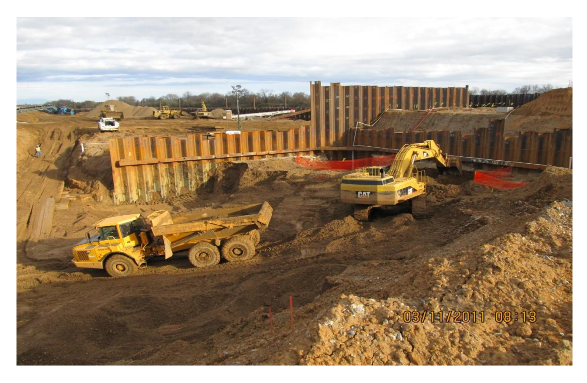
Balfour Beatty subcontractor Meyers excavating the pumping plant.