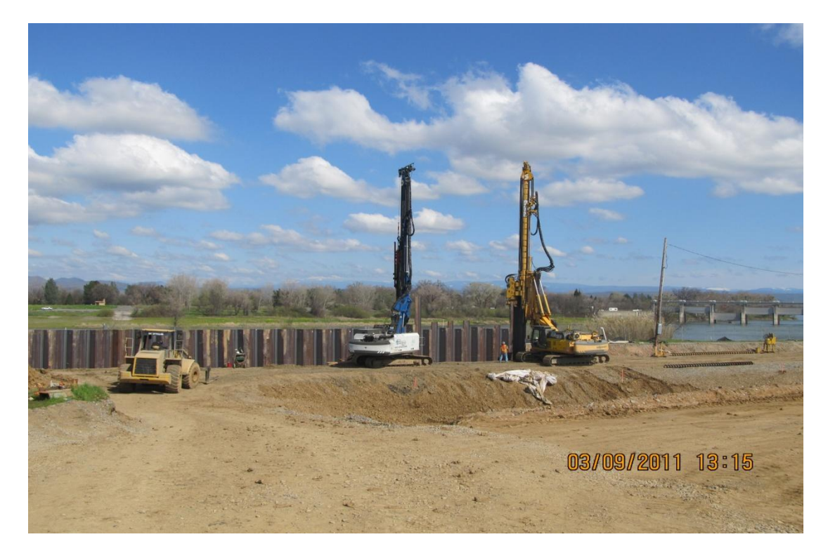
West Bay Builders subcontractor Hughes pre-drilling and driving sheet piles for the upstream canal.