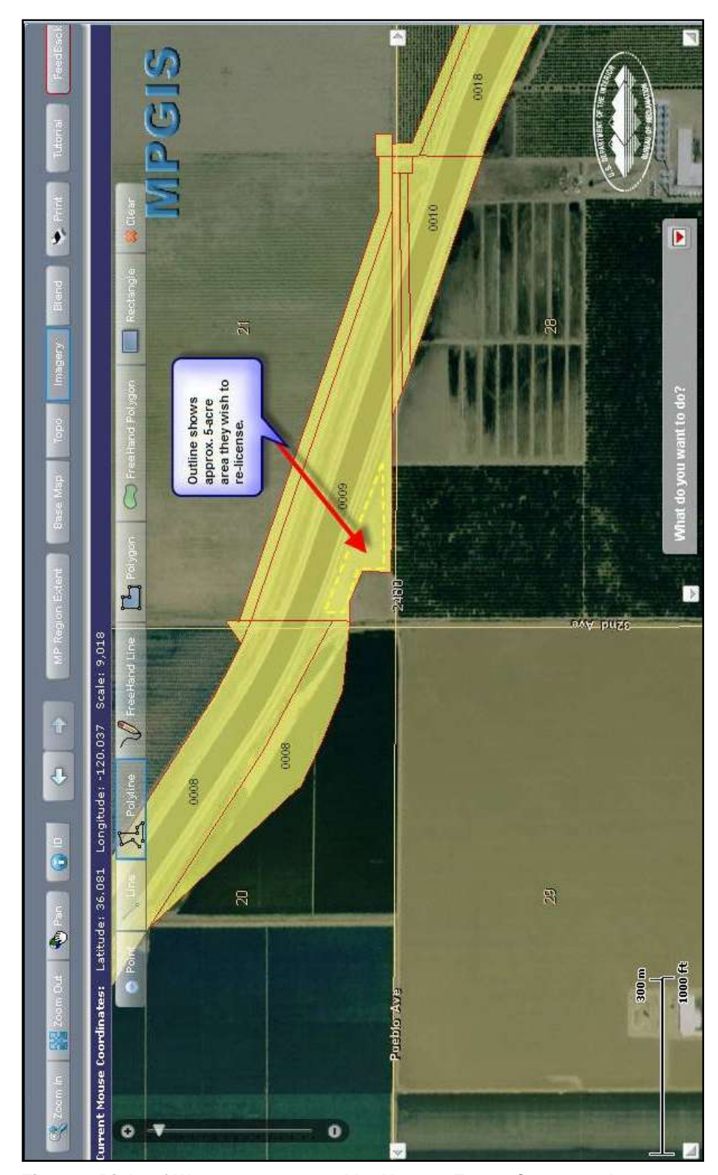
Figure 2 Right of Way area requested by Keenan Farms Company, Inc.