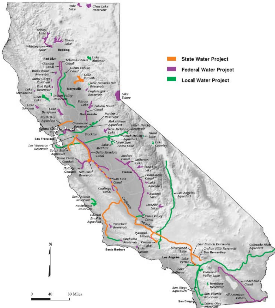
Figure 2 Depiction of Federal, State, and Local Conveyance Facilities in California From Department of Water Resources (DWR). 2003. California's Groundwater, Bulletin 118, 2003