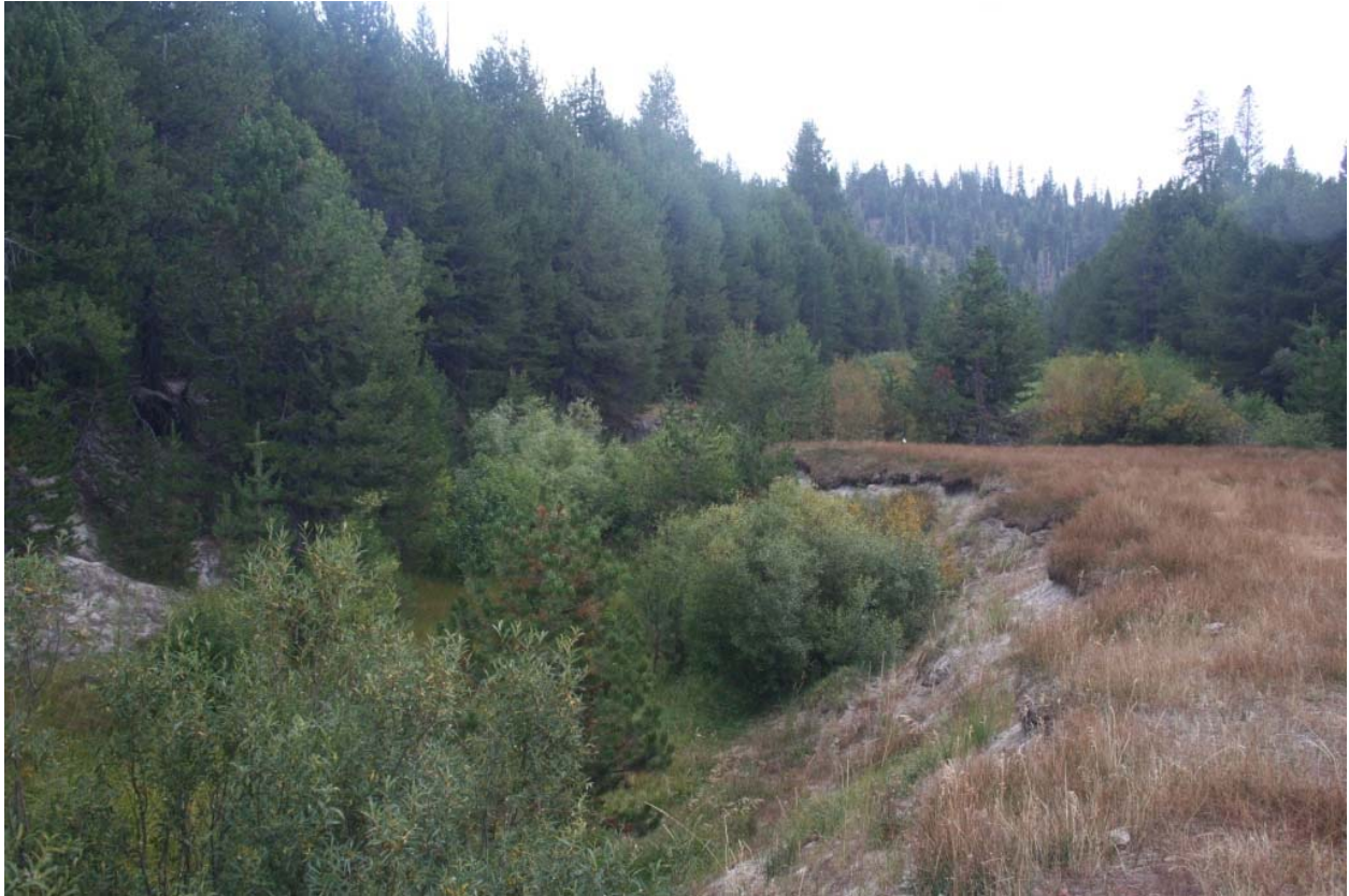
Photo 4. Looking upstream towards the barrier site, the eroding bank on the right of the photo will be laid back and stabilized.