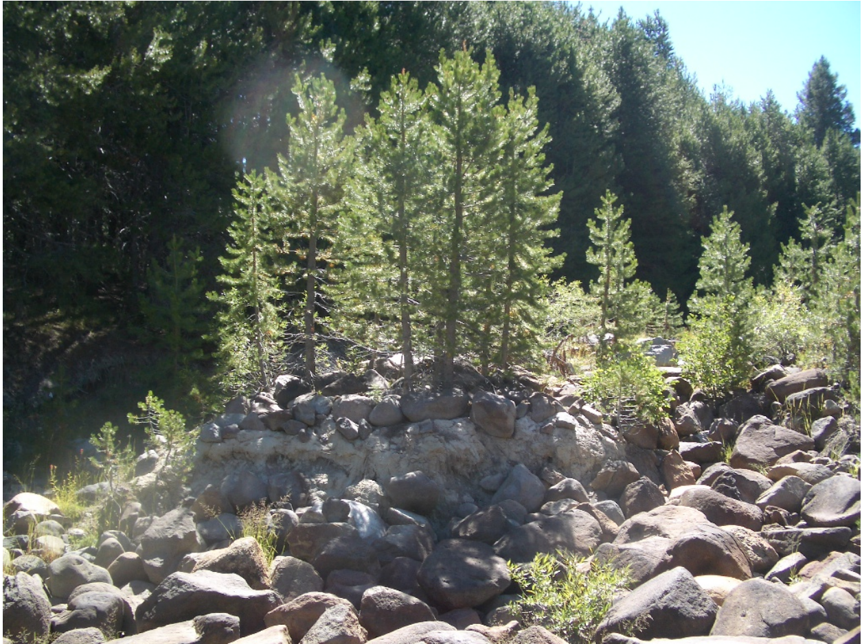
Photo 3. Current conditions at barrier site. The boulders have been placed in the channel to arrest a headcut. The streambed around the trees in the middle of the photo has eroded around the trees.