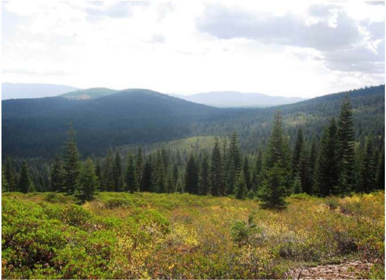
Photo 6. Ajoining U.S. Forest Service property to the south of the parcel in the Sagehen Basin.