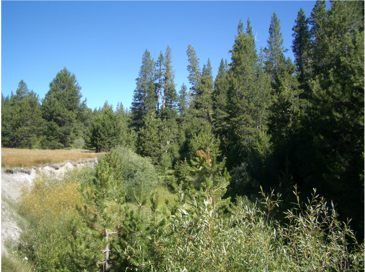
Photo 2. Looking downstream from the barrier site. The left bank is a wetland/meadow area, the right bank is a lodgepole pine forest.