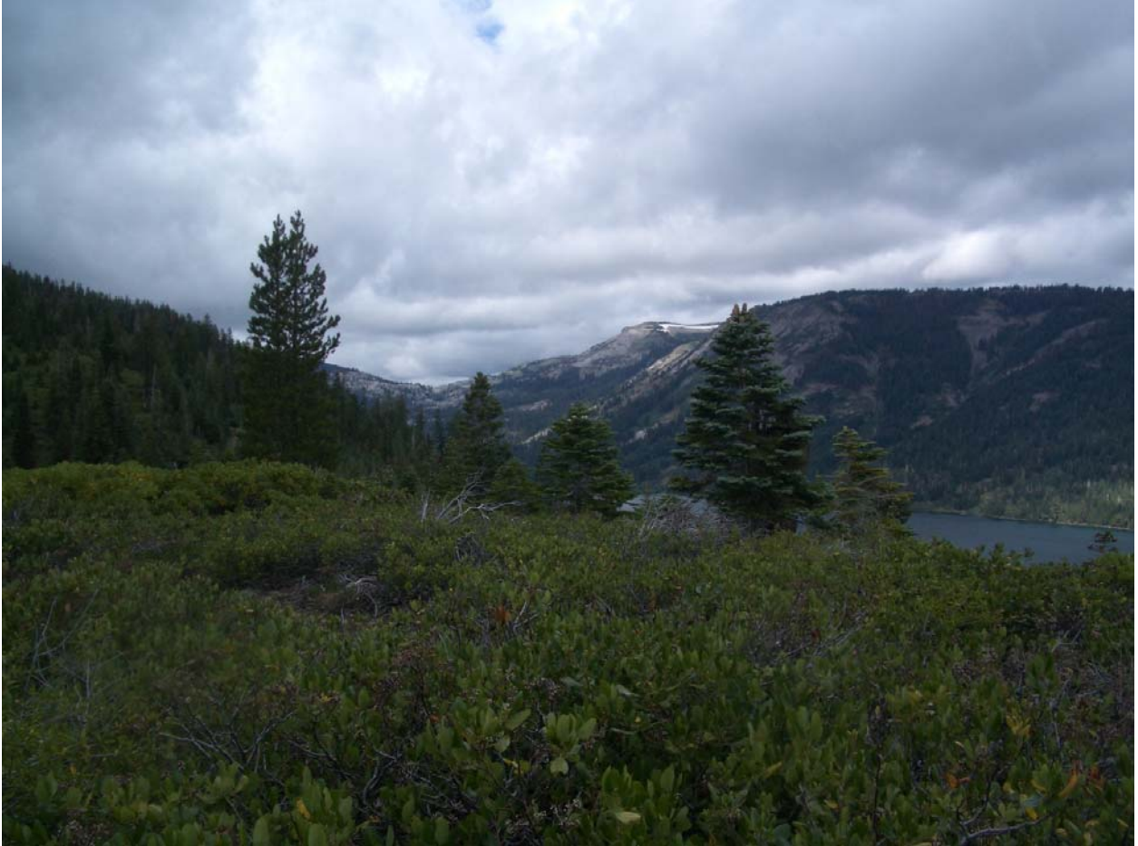
Photo 5. Adjoining U.S. Forest Service property on the ridgelines to the north and west of the parcel.