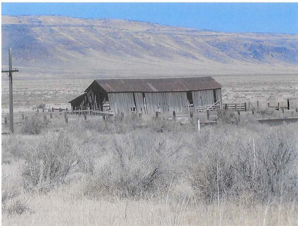
Figure 5. Battle Mountain Community Pasture barn.