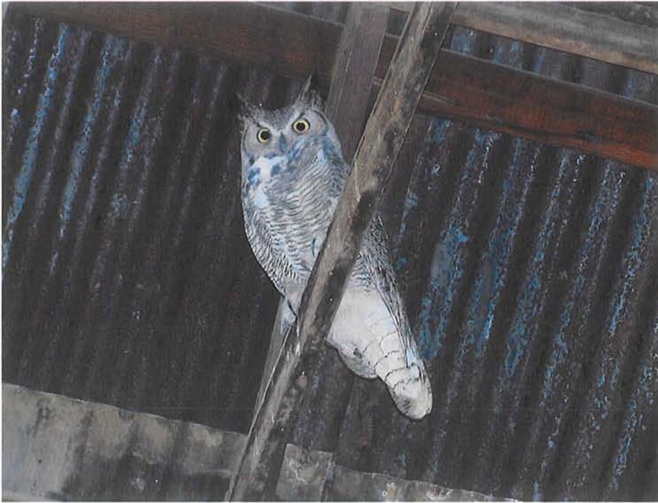
Figure 6. Great horned owl inside the Battle Mountain Community Pasture barn.