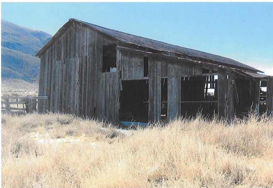
Figure 4. Battle Mountain Community Pasture barn.