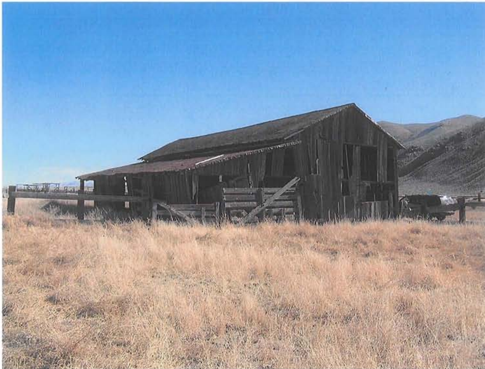
Figure 3. Battle Mountain Community Pasture barn.

Reclamation would not allow PCWCD to demolish and remove the barn, and the hazard that exists to human and livestock safety would continue to exist, as long as the barn is standing, and until it collapses.