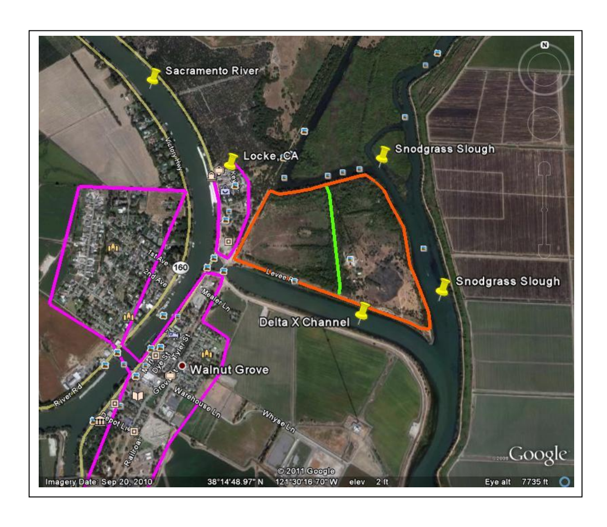
Figure 1: Proposed Action Area and Nearby Communities