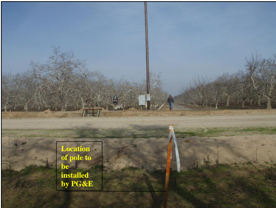
Figure 2. Project Location