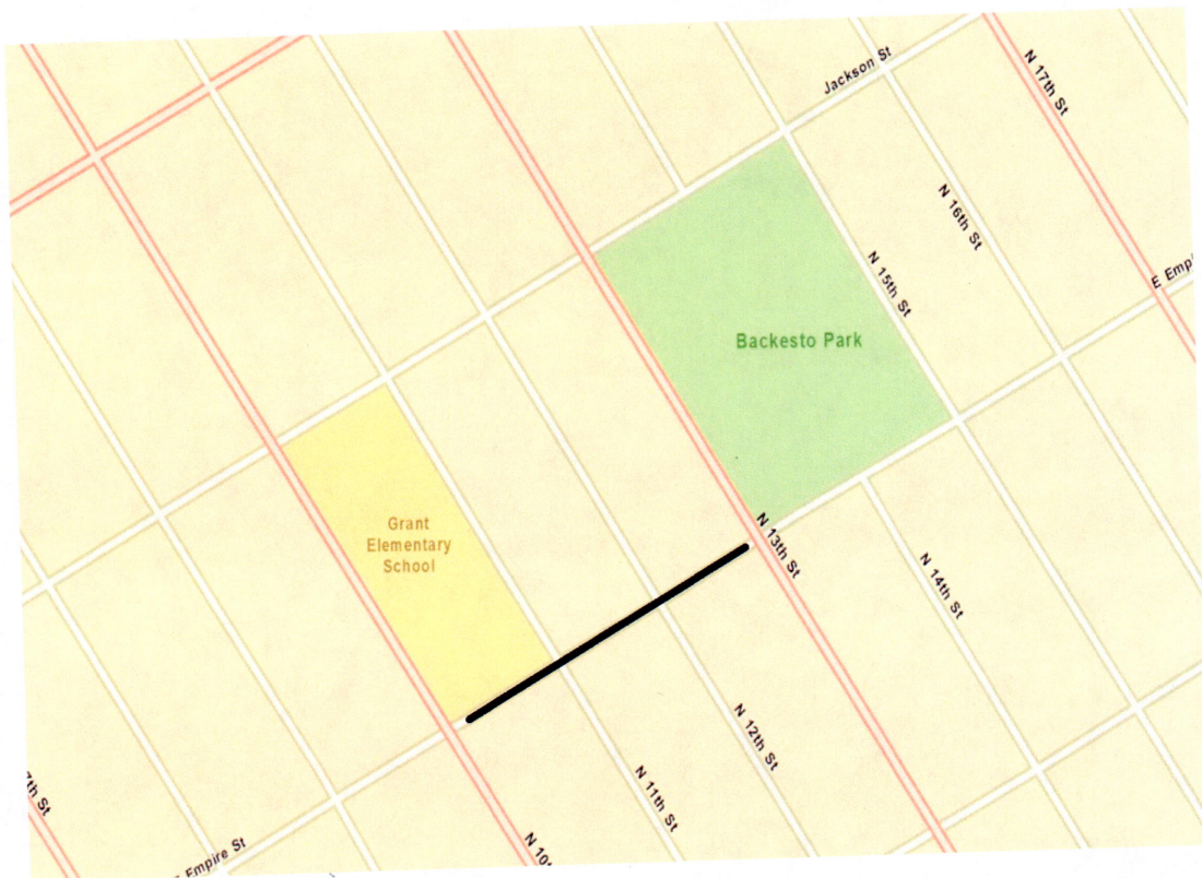
Figure 4, Schools D Project Map

Construction of the pipelines follows the “cut and cover” method. This method involves excavating an open trench to accommodate the size of the pipe, laying the pipeline, and replacing and compacting soil to refill the trench.