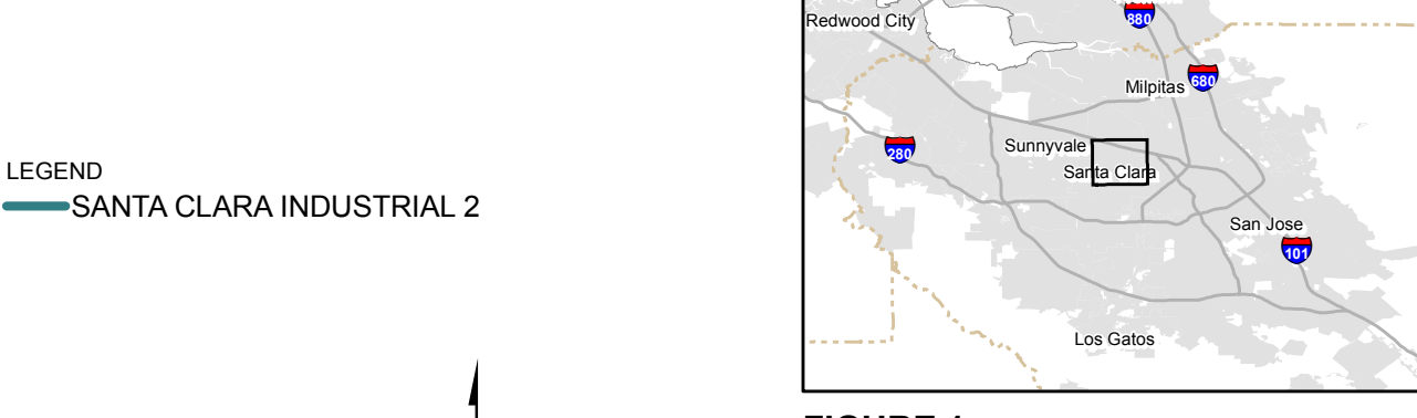
FIGURE 1 Santa Clara Industrial 2 Pipeline Extension South Bay Water Recycling Program, California