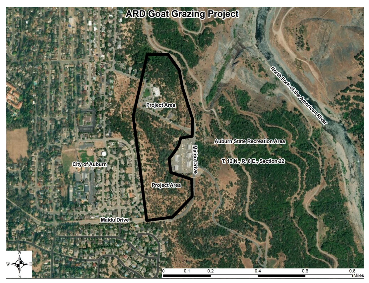
Figure 1. Project Area