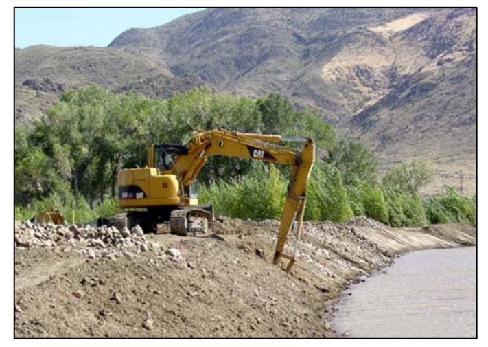
Riverbank shaping and rock cluster bank protection would occur along new meanders.

would be undertaken at the 102 Ranch site, including construction access roads, stockpiles, and staging areas; channel modifications; and other design features. Figure 3-3c shows the proposed future conditions at the site, including the type, location, and extent of planned vegetation communities. Upon completion of restoration planting, a wire fence and associated allterrain vehicle access trail will be constructed around the restored areas.