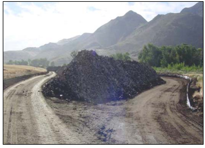
Proposed construction elements include temporary access roads and stockpiles.