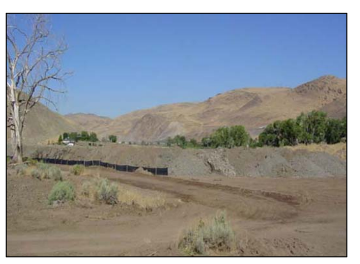
Excess soil would be shaped into habitat hillocks at Lockwood and Mustang Ranch.

The excavation of wetlands and construction of new meanders is expected to produce suitable earth material, which will be shaped into hillocks to create more natural undulations and topographic variation at Lockwood and Mustang Ranch (excavated material at 102 Ranch would be used for fill). Hillocks will increase habitat variability for terrestrial species. Existing mature cottonwood/willow forest, riparian shrublands, emergent/wet meadow vegetation, and sagebrush shrublands will be preserved to the maximum extent possible to reduce revegetation costs and improve project success.