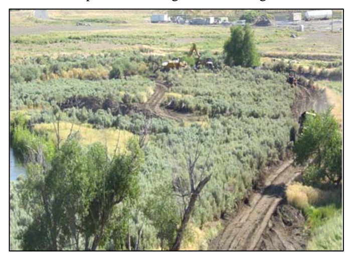
Oxbow-type habitats would be created or enhanced as part of the Proposed Action.

raising the river and reconnecting it to the floodplain;