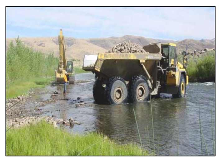
An articulated dump truck would be used to transport rounded rock and create riffle structures.

Prior to any in-channel work, construction crews will place a silt curtain across the existing channel at the lower end. To isolate the construction area and prevent sediment contamination, crews will also place a silt curtain at the lower confluence of the old and new channels. Turning flows into the newly