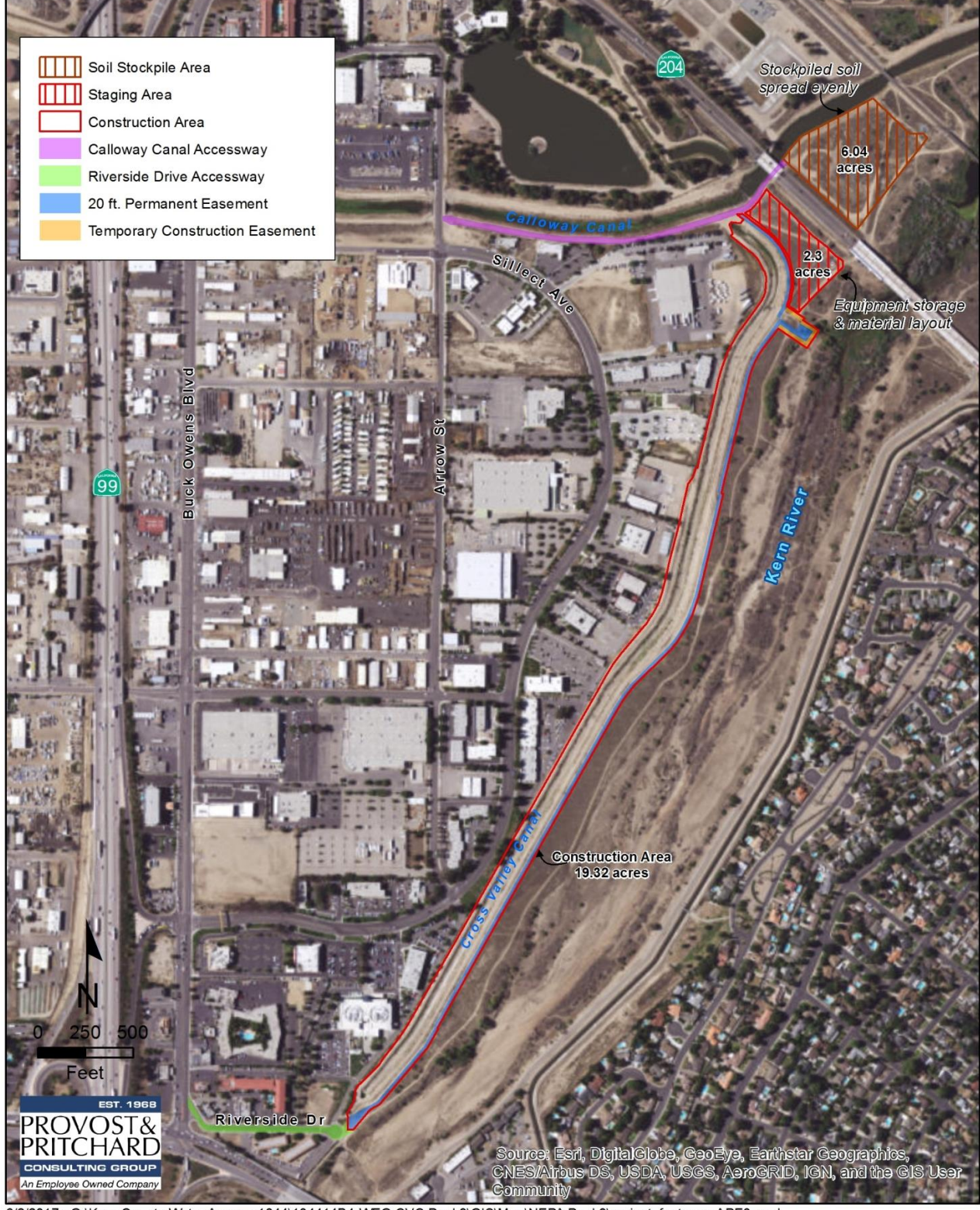
6/2/2017 : G:\Kern County Water Agency-1044\104414B4-WEG CVC Pool 8\GIS\Map\NEPA Pool 8\project_features_APE3.mxd