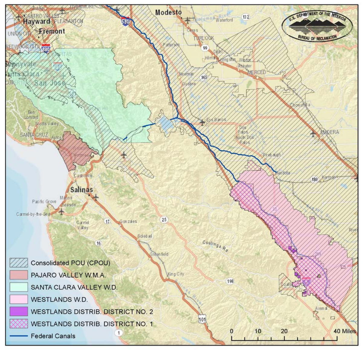
Figure 1 Proposed Action Area

This section describes the service area for the contractors listed in Table 1 which receive CVP water from the Delta via Delta Division, San Felipe Division, and San Luis Unit CVP facilities. The study area, shown in Figure 1, includes portions of Fresno, Kings, and Santa Clara Counties. Maps of individual contractor CVP service areas can be found in Appendix A. As described in Section 1.3, Pajaro Valley does not have the ability to receive CVP water at this time and is not included in this analysis.