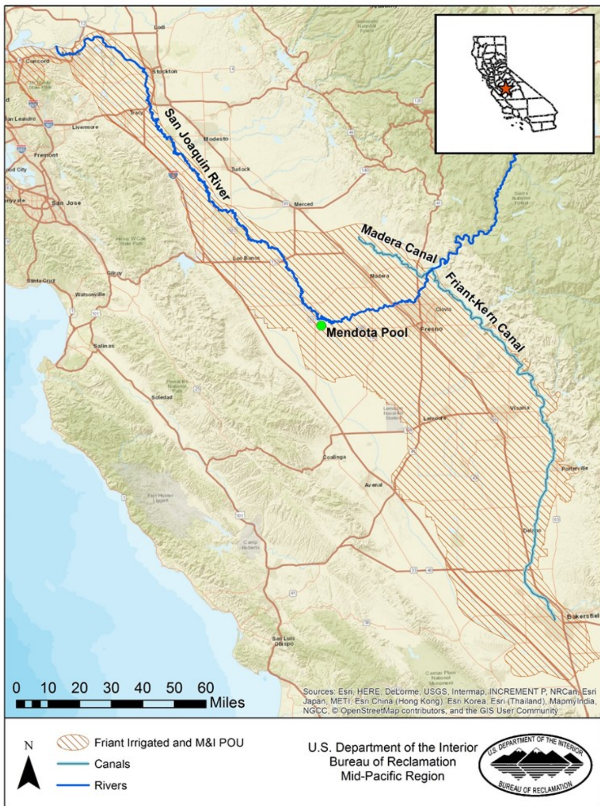
Figure 1 Friant Place of Use (POU) location within the Central Valley