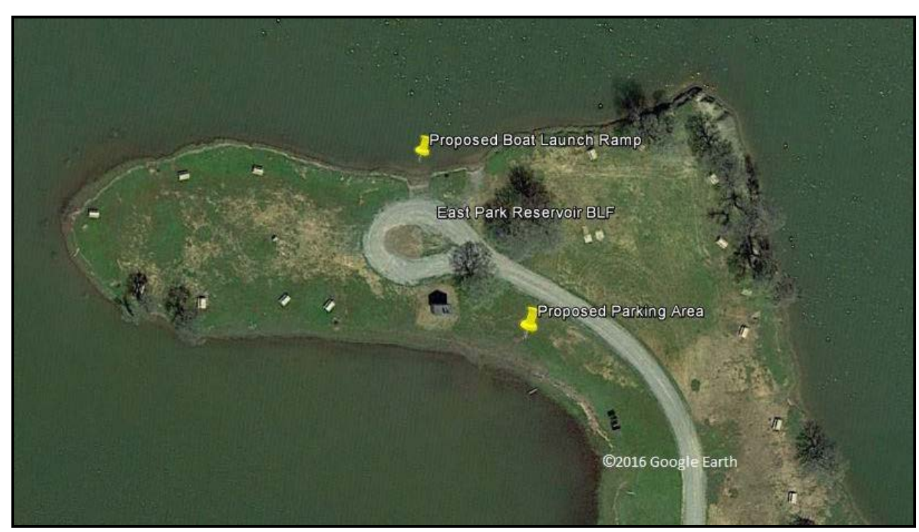
Figure 3. Approximate Locations of Boat Launch Facility Improvements