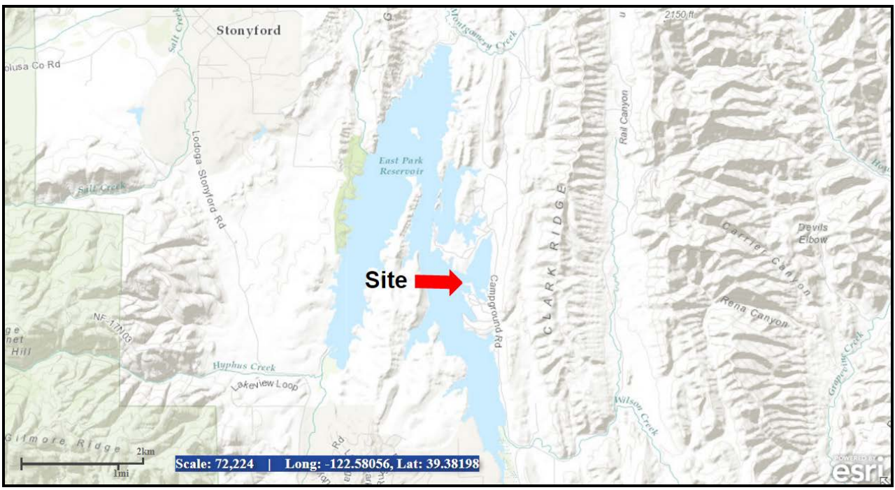
Figure 1. Project Location

The purpose of the Proposed Action is to provide continued boating opportunities for the public at EPR with safe, accommodating and environmentally-responsible facilities.