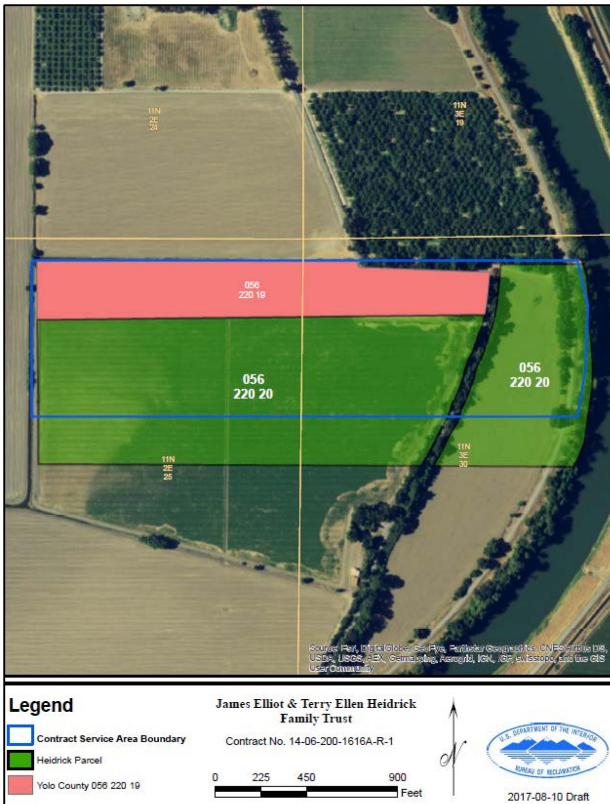
Figure 2. Site Map with subject portion of Settlement Contract property overlain in green.