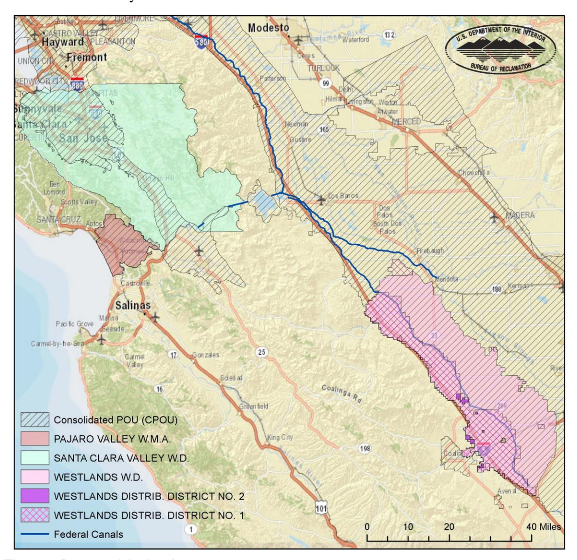
Figure 1 Proposed Action Area

This section describes the service area for the contractors listed in Table 1 which receive CVP water from the Delta via Delta Division, San Felipe Division, and San Luis Unit CVP facilities. The study area, shown in Figure 1, includes portions of Fresno, Kings, and Santa Clara Counties. Maps of individual contractor CVP service areas can be found in Appendix A. As described in Section 1.3, Pajaro Valley does not have the ability to receive CVP water at this time and is not included in this analysis.