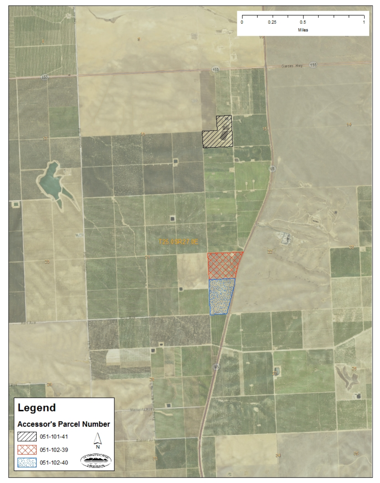
Figure 2 Parcels Proposed for Inclusion into the District